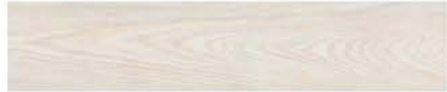
JK - 915441