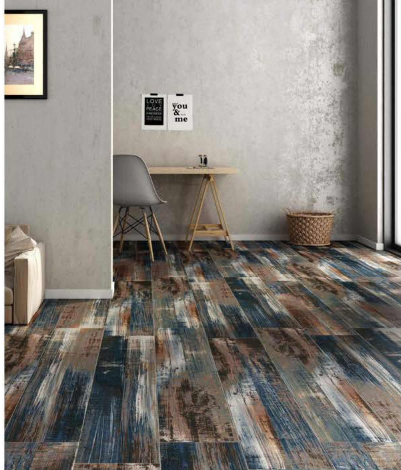
tiles shown: D6 - 15242

LIVING BATHROOM KITCHEN OUTDOOR HEAVY TRAFFIC