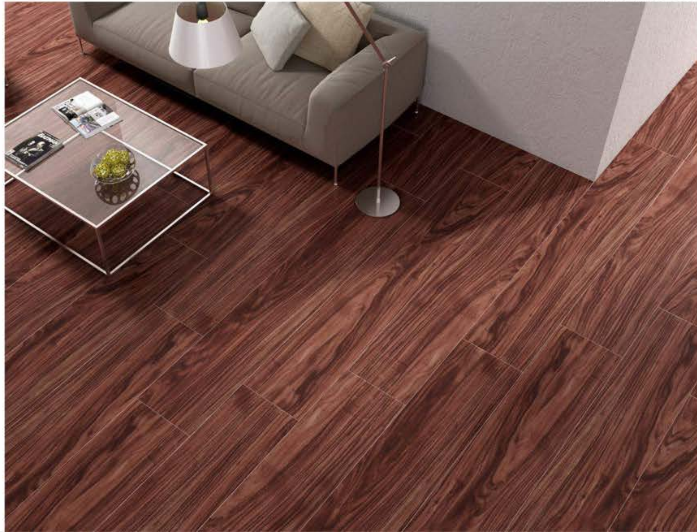
Tiles shown: D6 - 15248