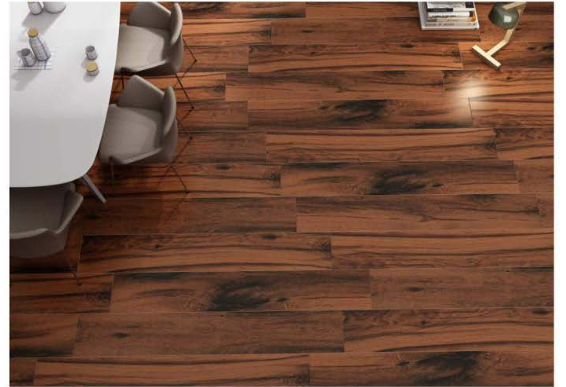
tiles shown: D6 - 15235