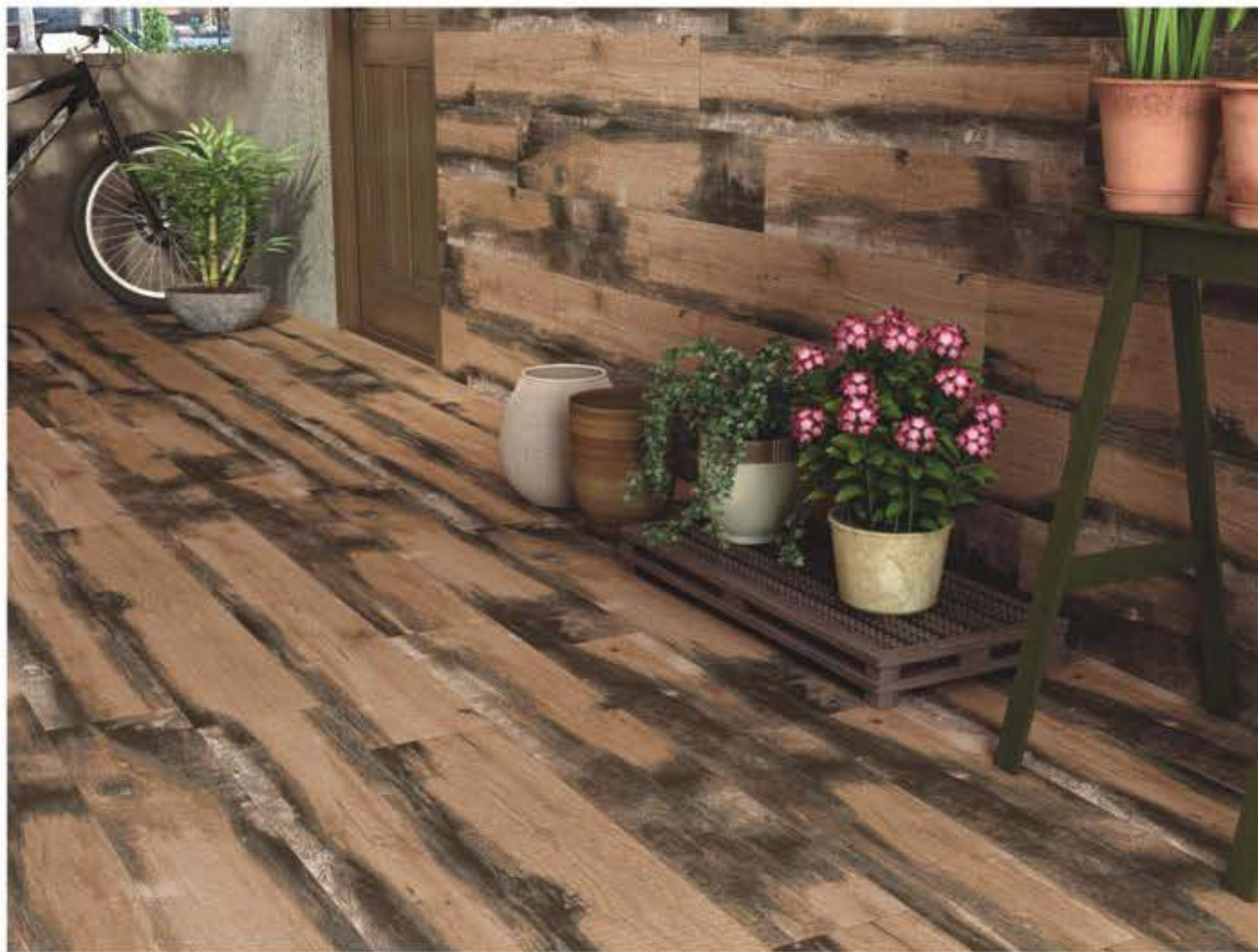
tiles shown: M5 - 60247