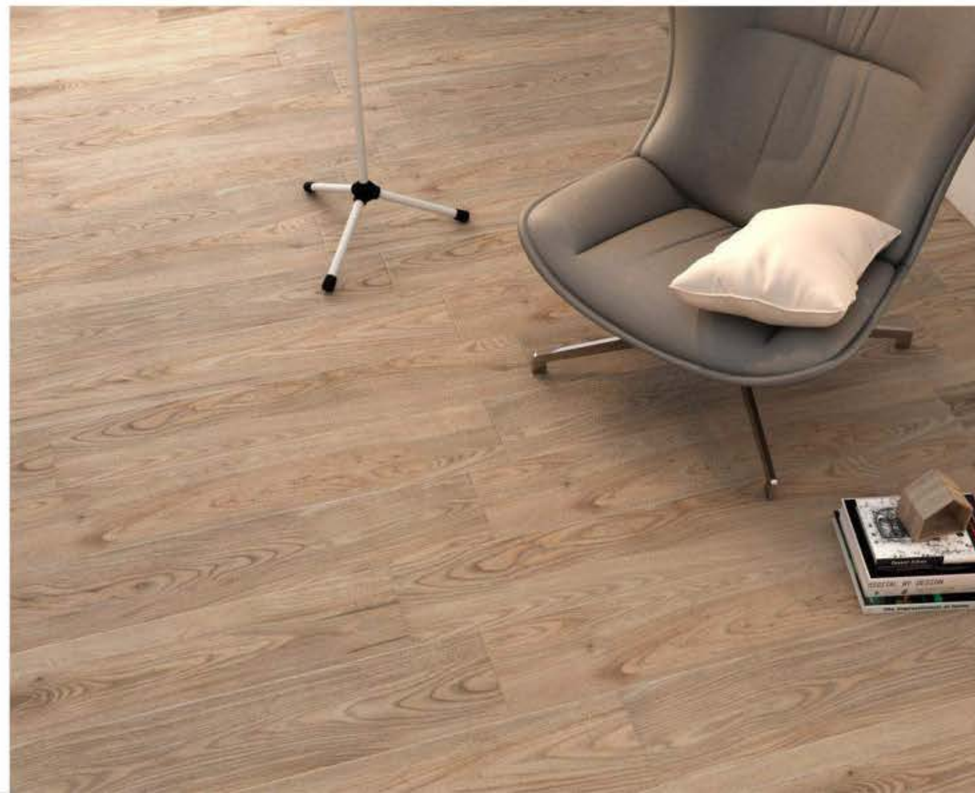
tiles shown: JK - 915442