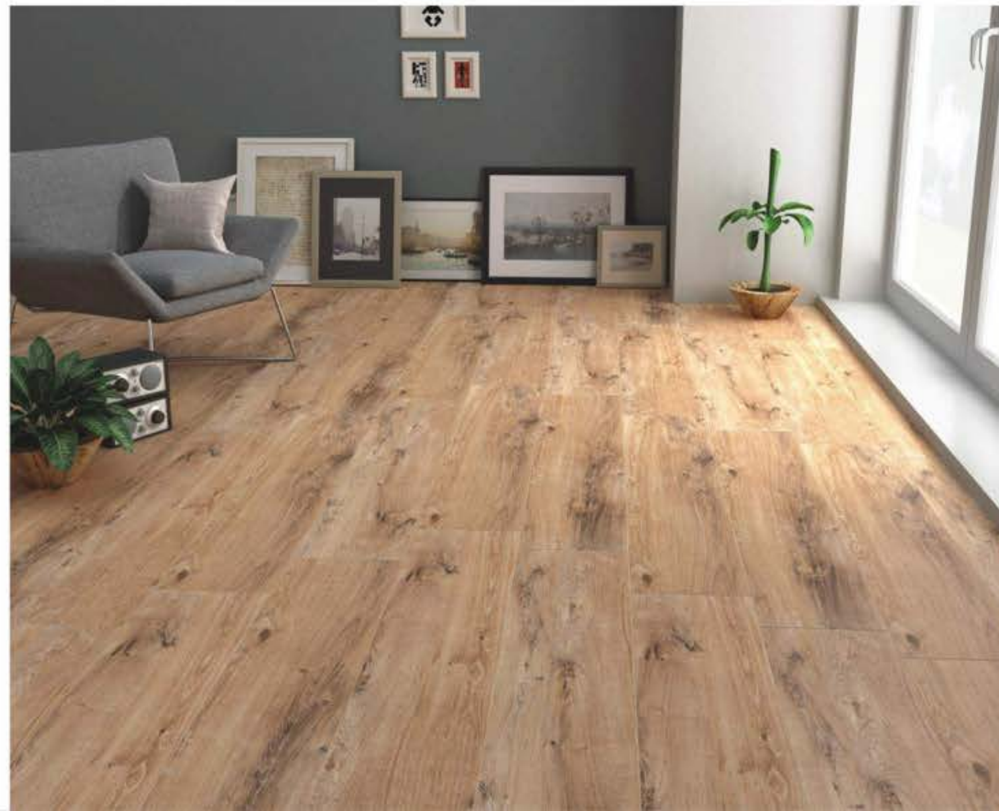
liles shown: D6 - 15250