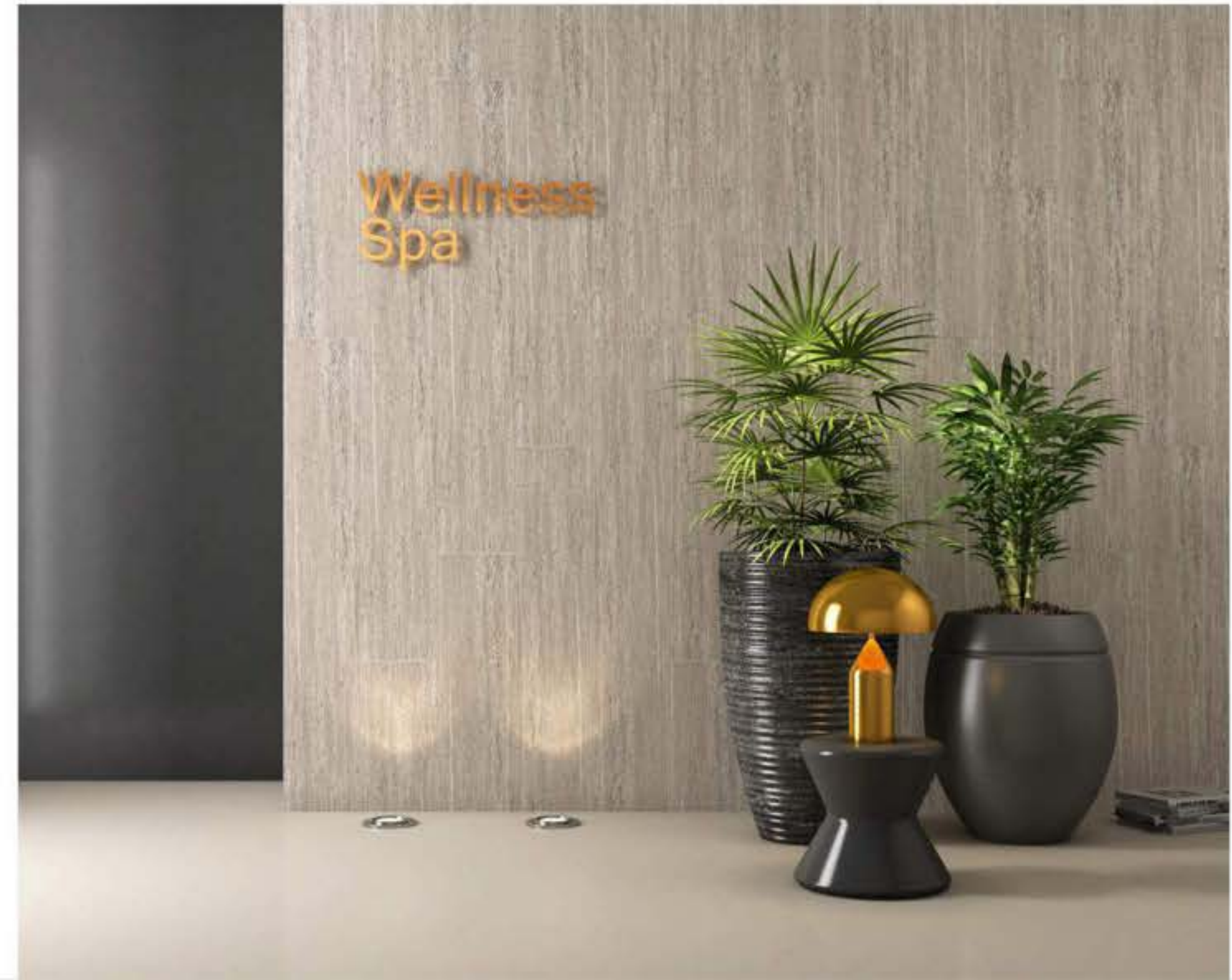
tiles shown: T2 - 465402