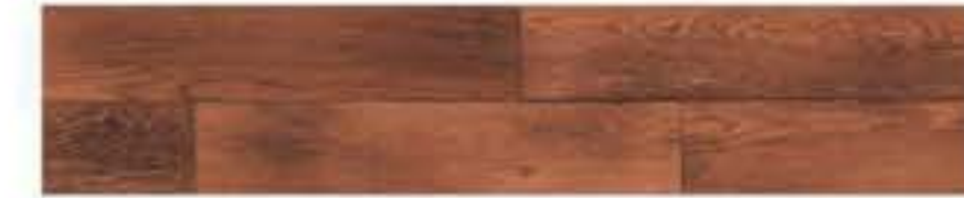
JK - 915447