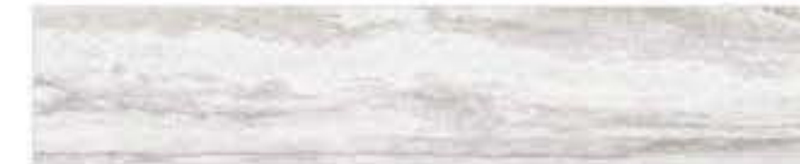
T8 - 8001