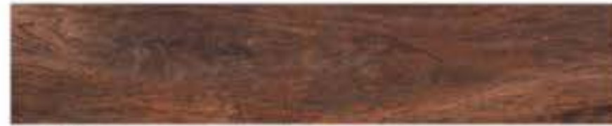
JK - 915446