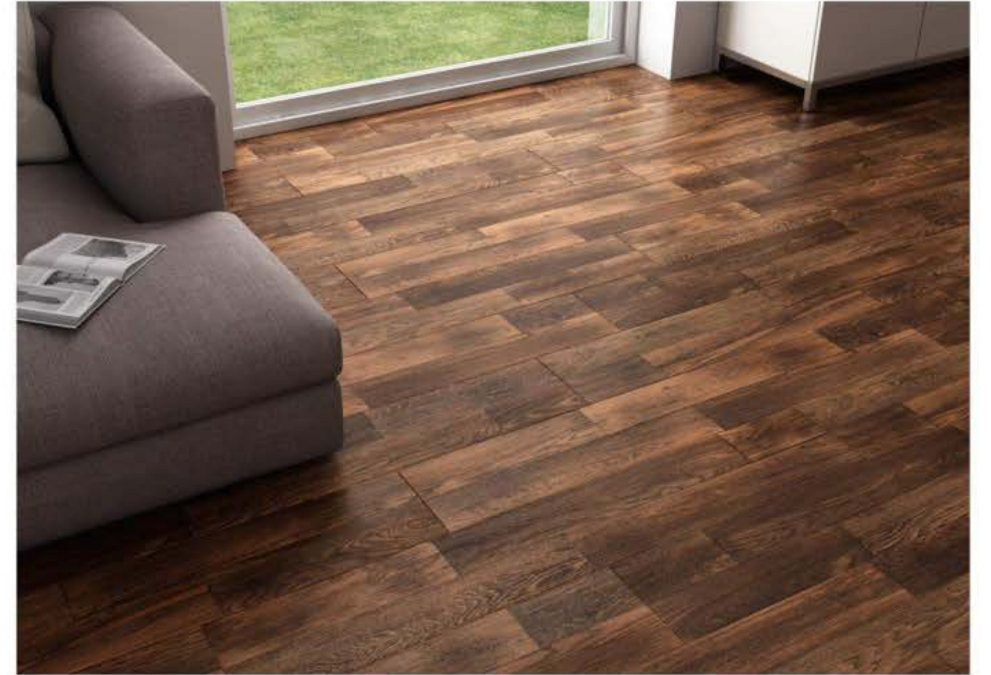
tiles shown: JK - 915444