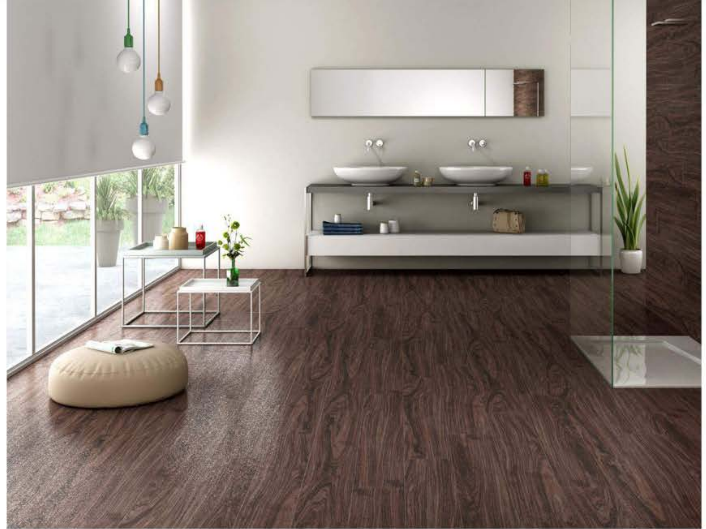
tiles shown: S7 - 20159