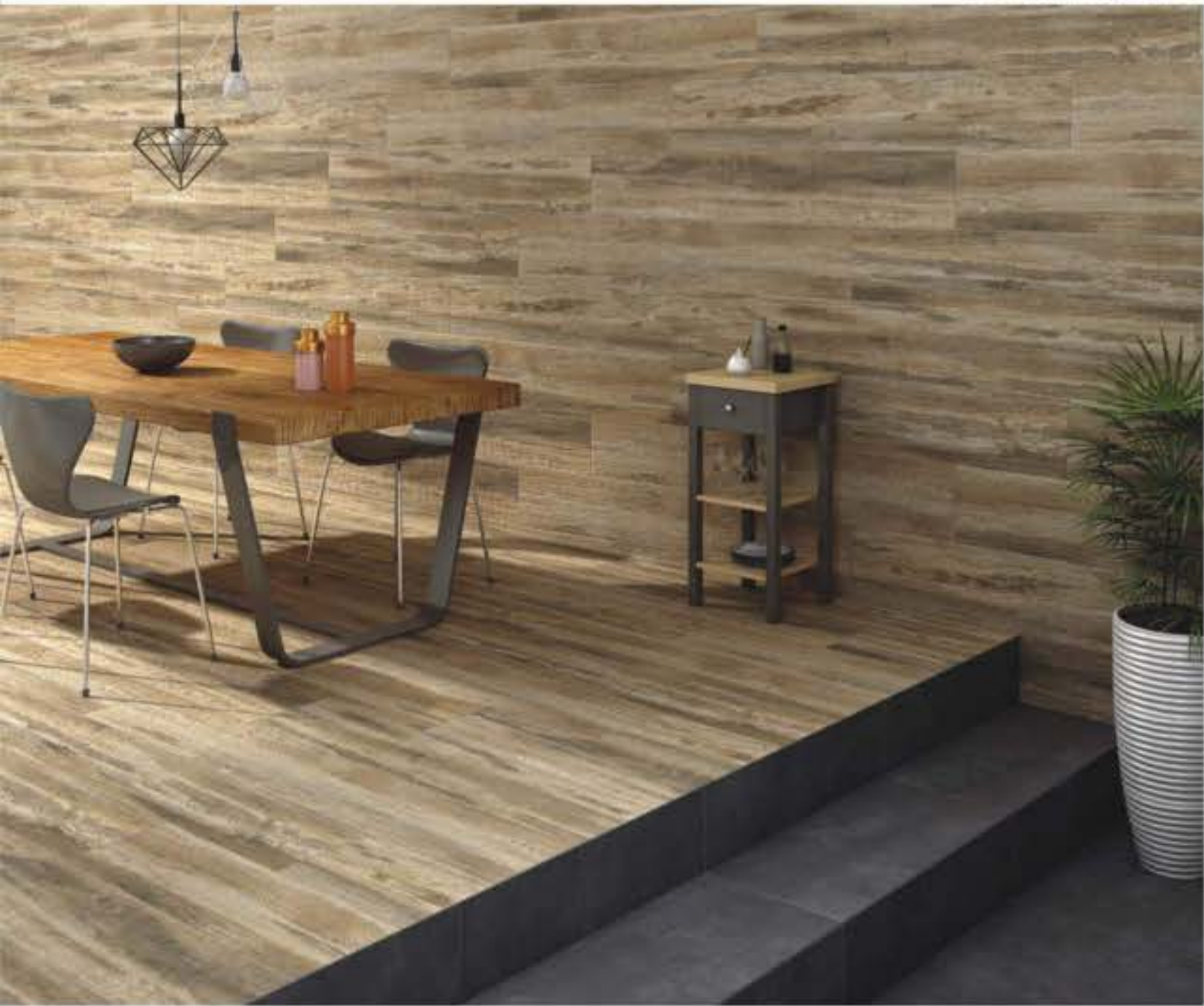
tiles shown: P5 - 21081