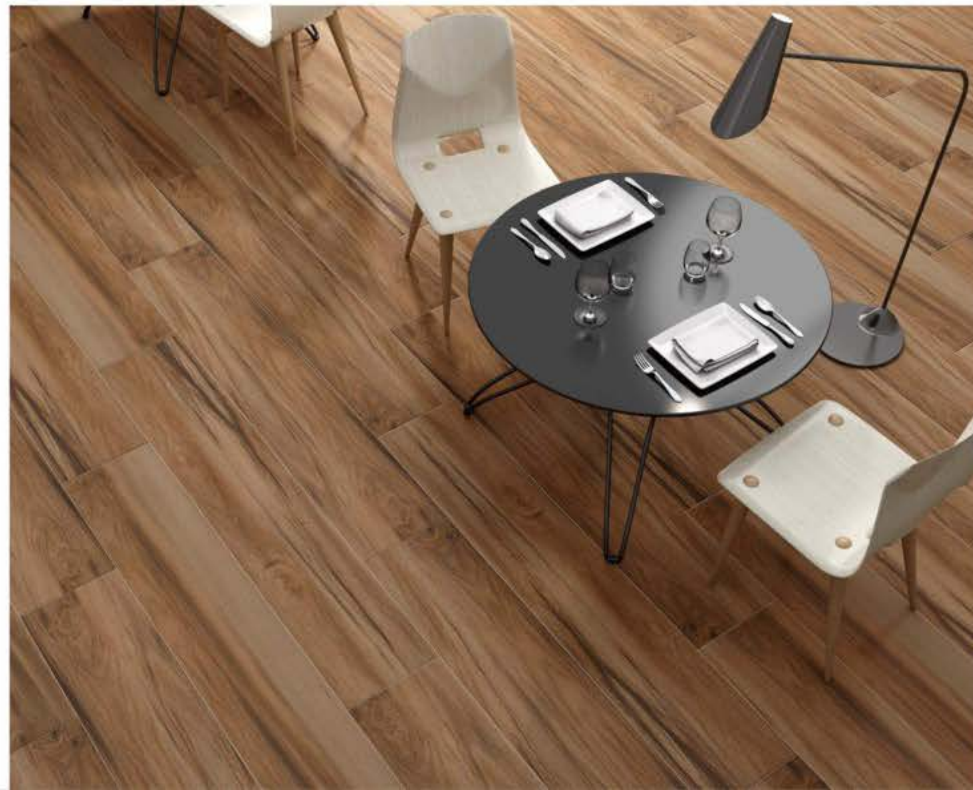
tiles shown: D6 - 15247