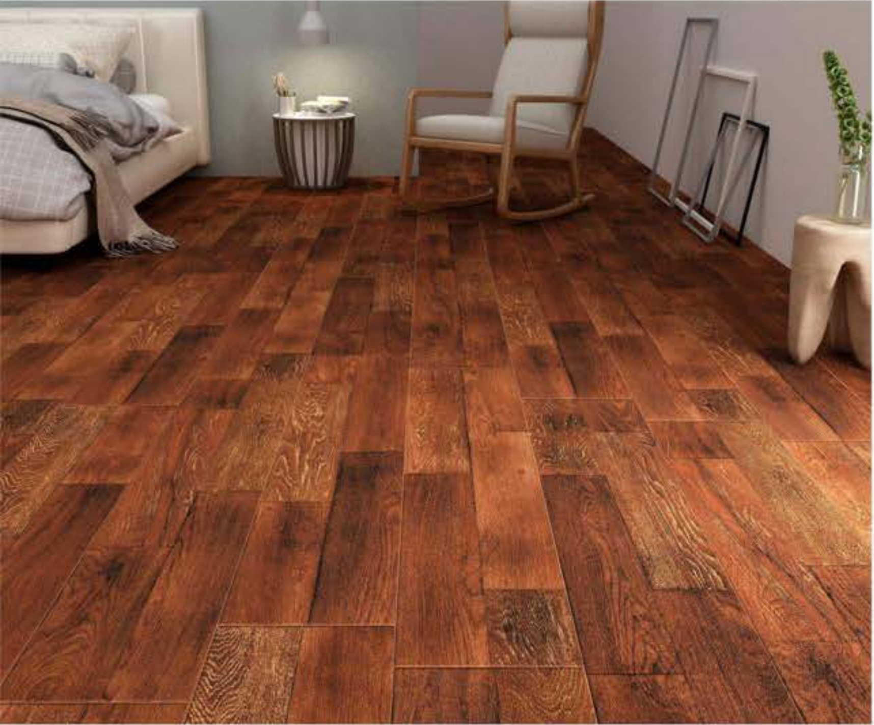
tiles shown: JK - 915445