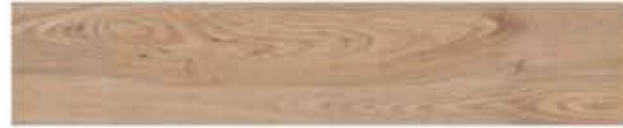
JK - 915442