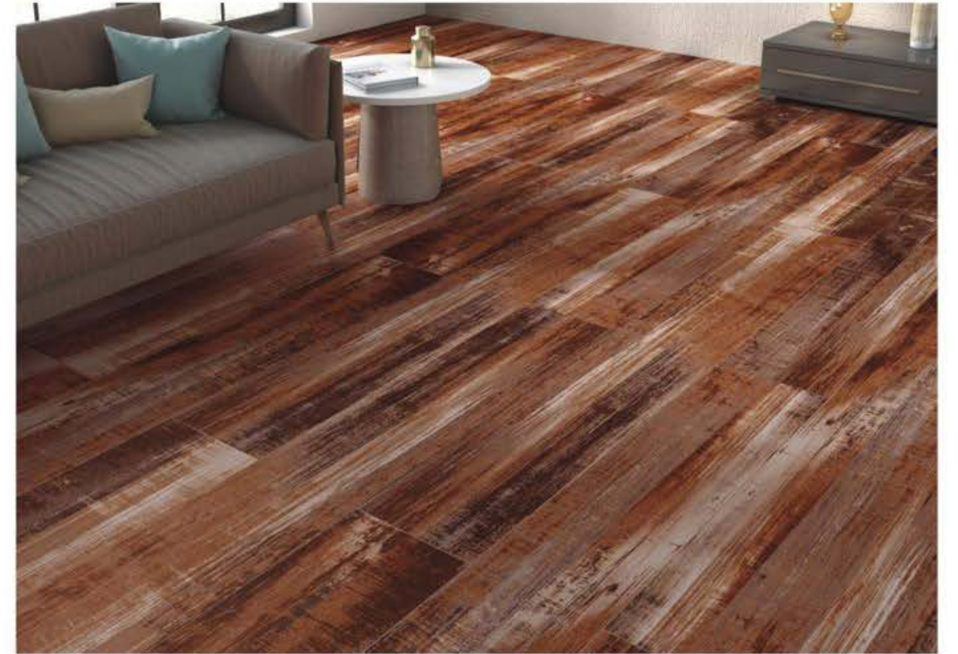
Tiles shown: D6 - 16243