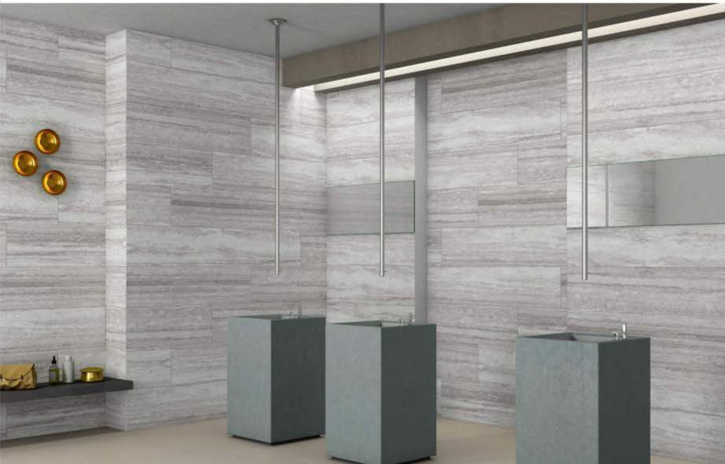
tiles shown: T8 - 8001