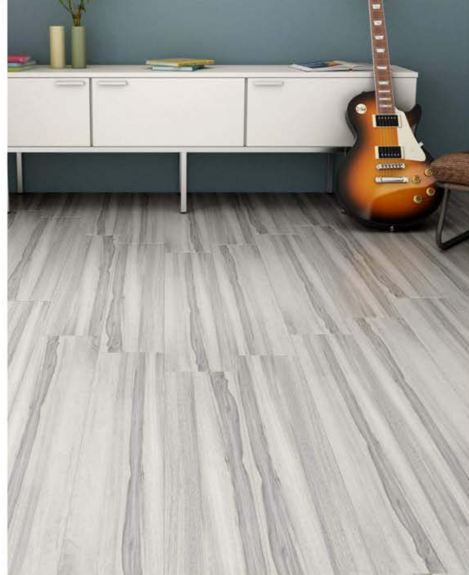
tiles shown: 5008

LIVING BATHROOMS KITCHEN OUTDOOR HEAVY TRAFFIC