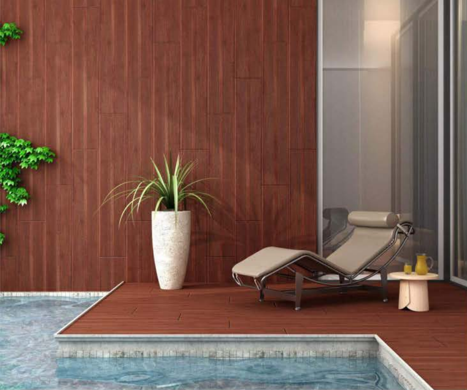
tiles shown: deckwood teak