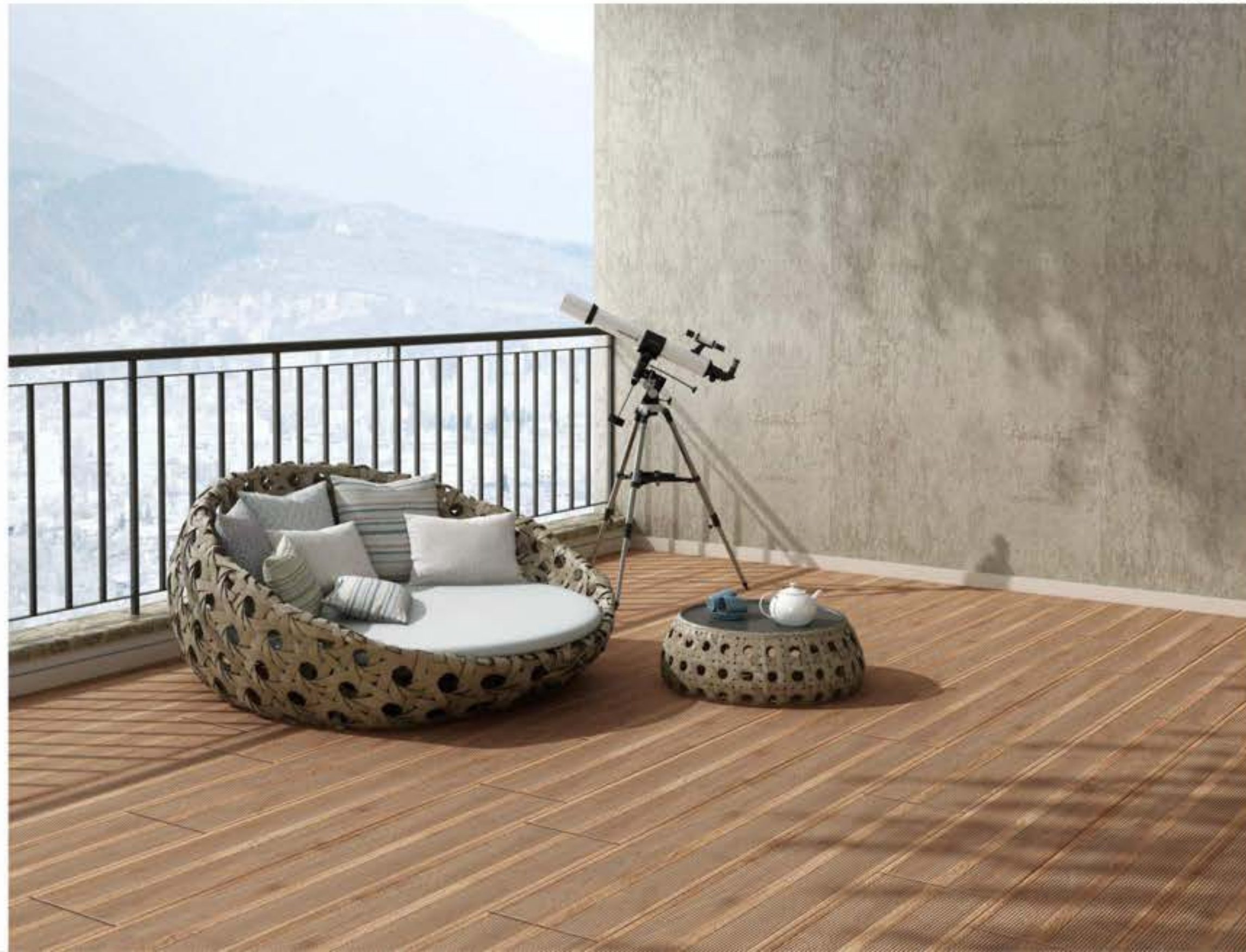
tiles shown: deckwood beige