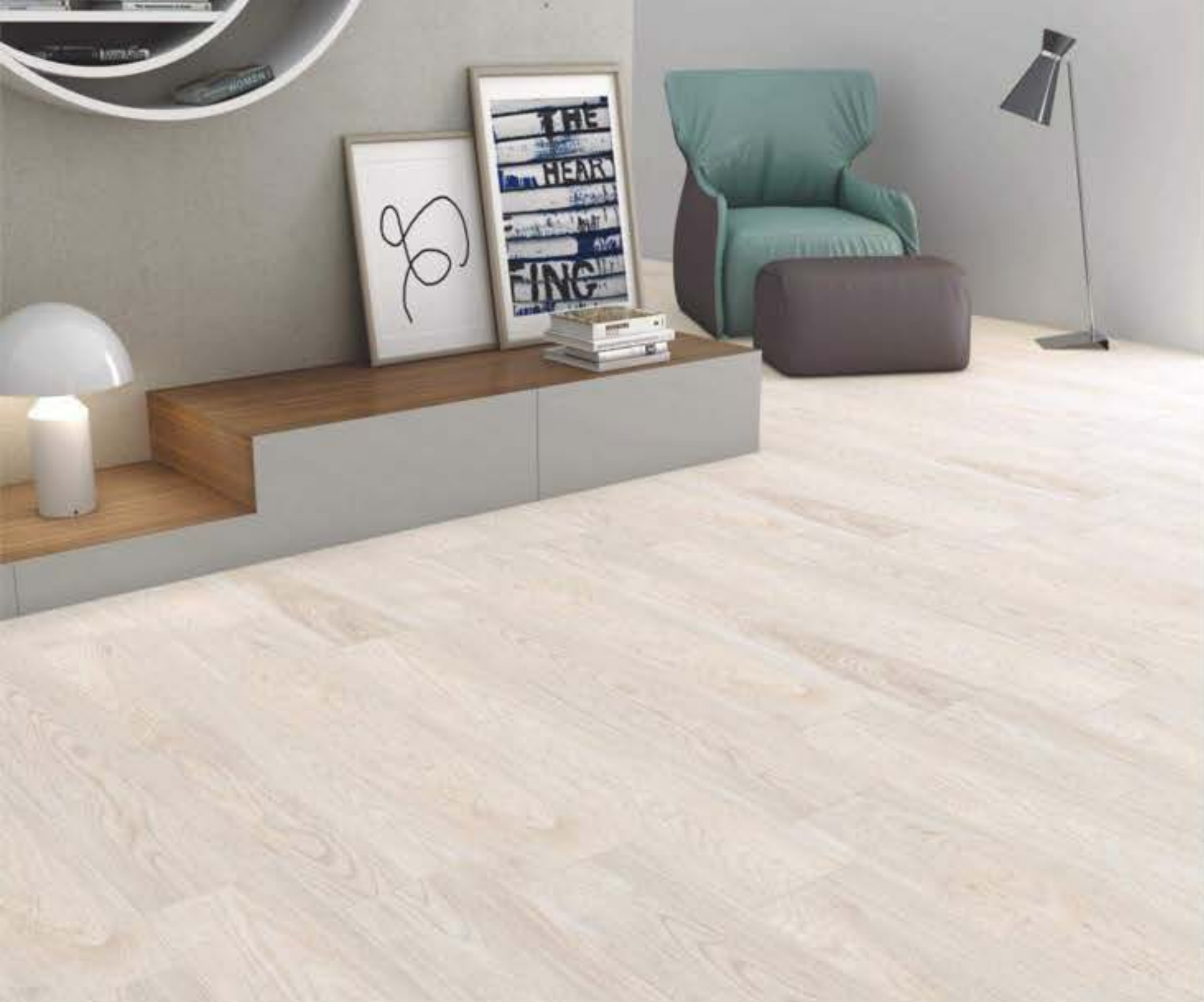
tiles shown: JK - 915441