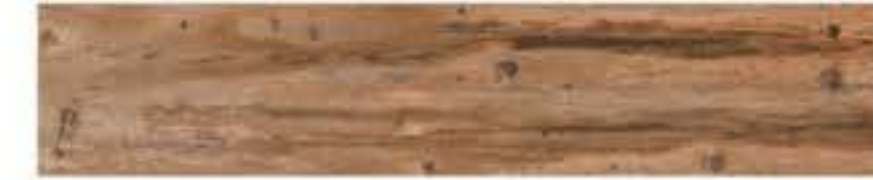
JK - 915448