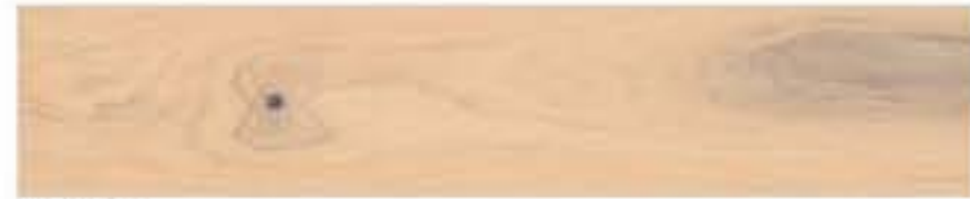
JK - 915443