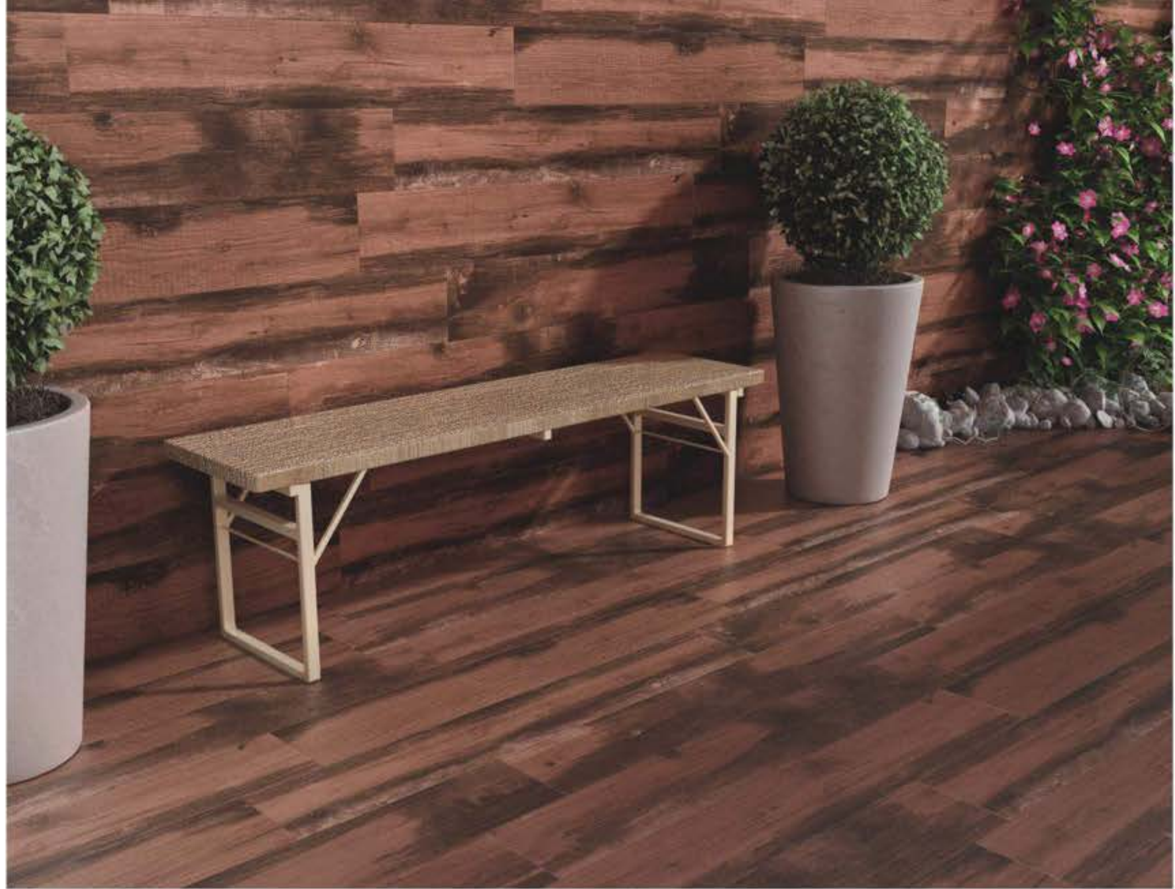
tiles shown: P5 - 21081