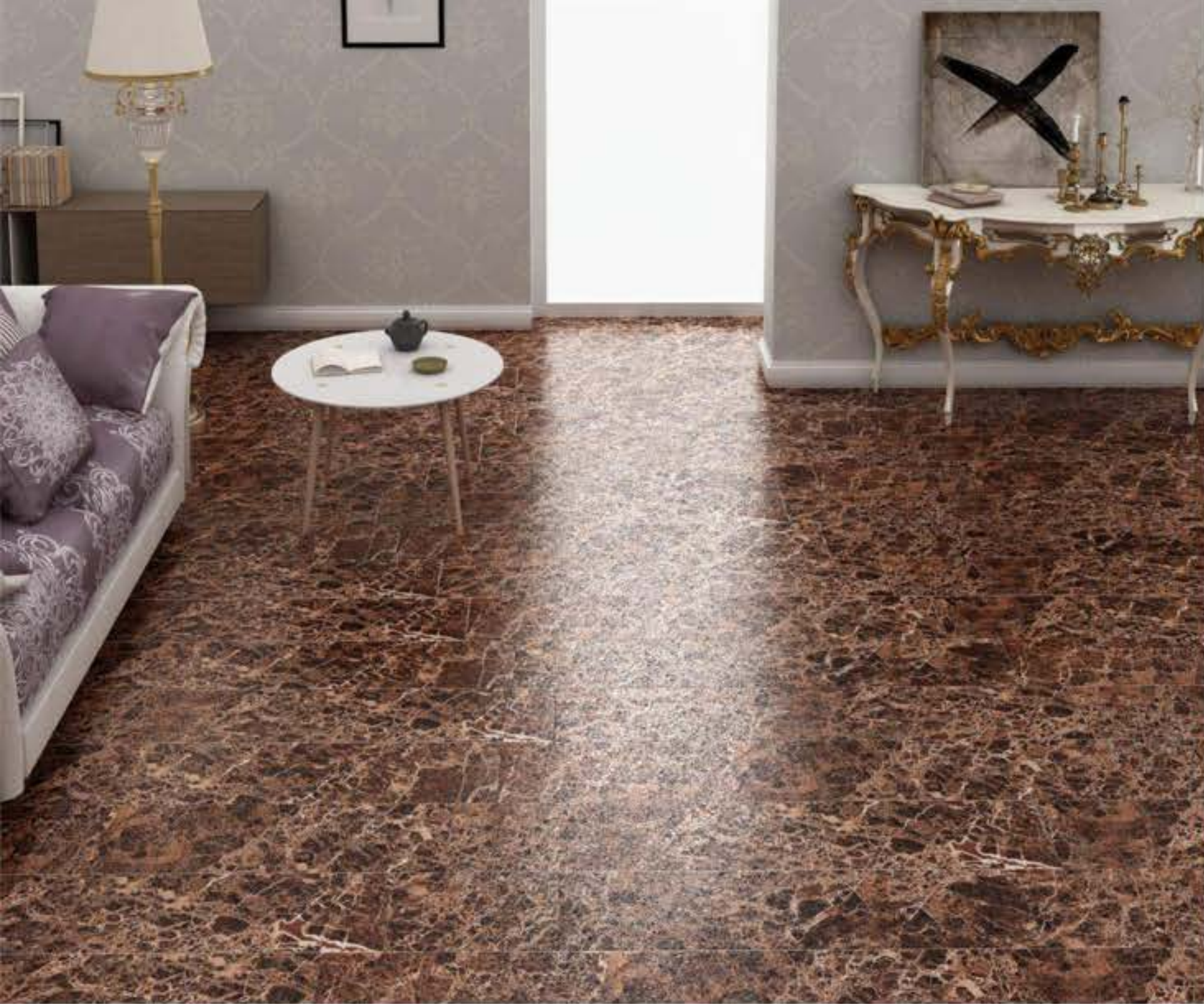
tiles shown: emperador gold