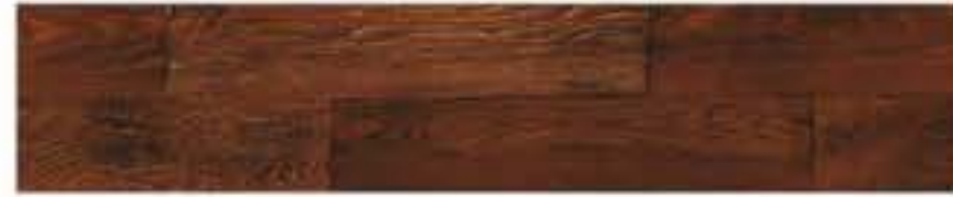
JK - 915445