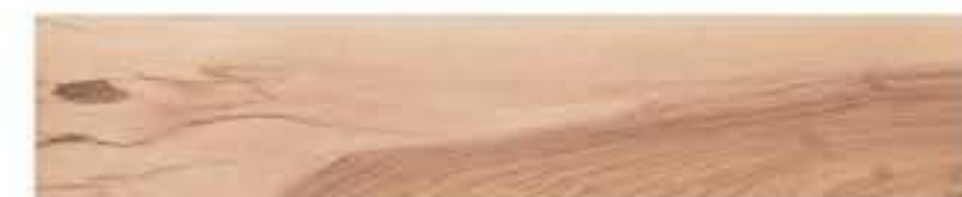
QL - 1224952