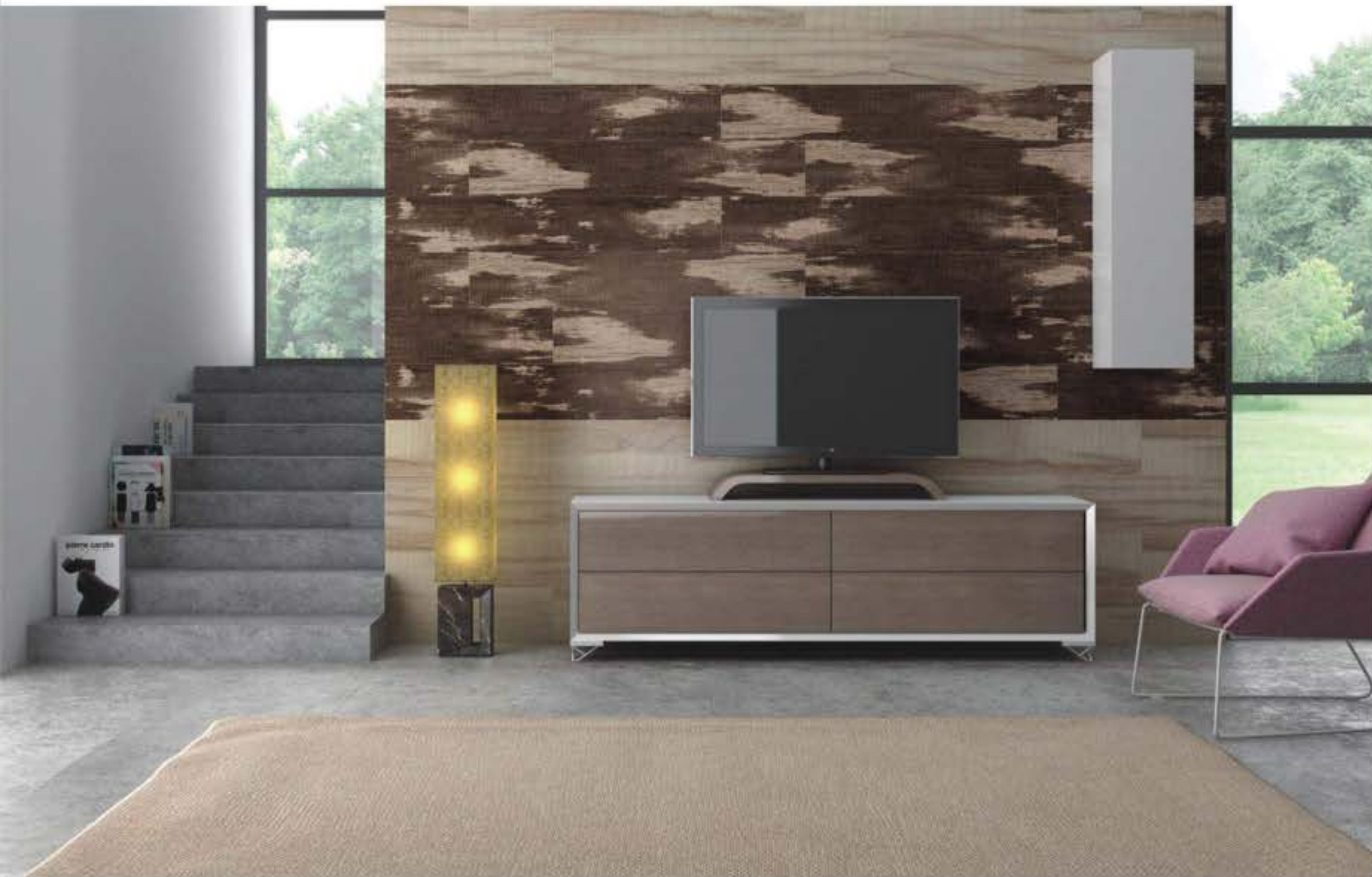
tiles shown: H - 653032