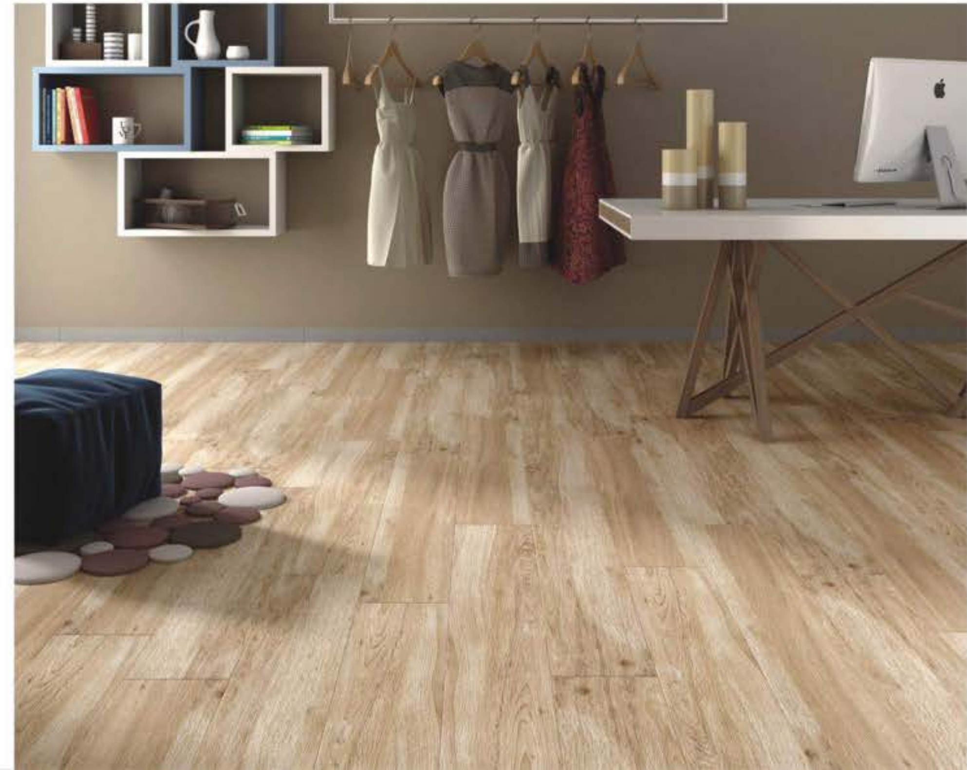
tiles shown: 5002