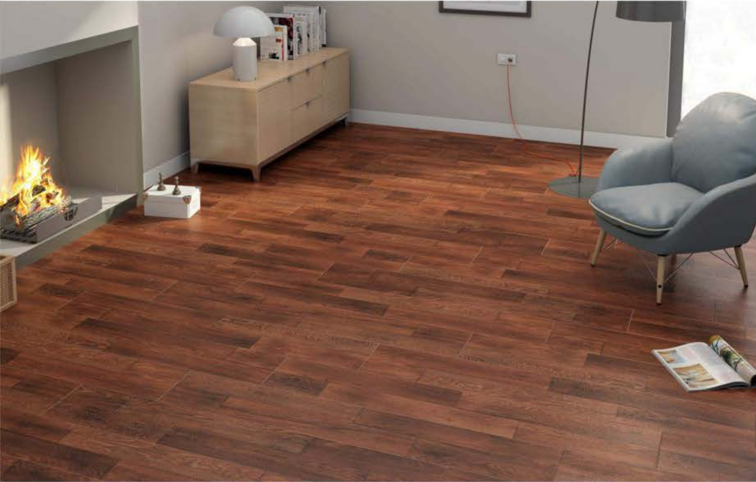
tiles shown: JK - 915447