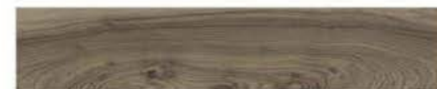
QL - 1224953