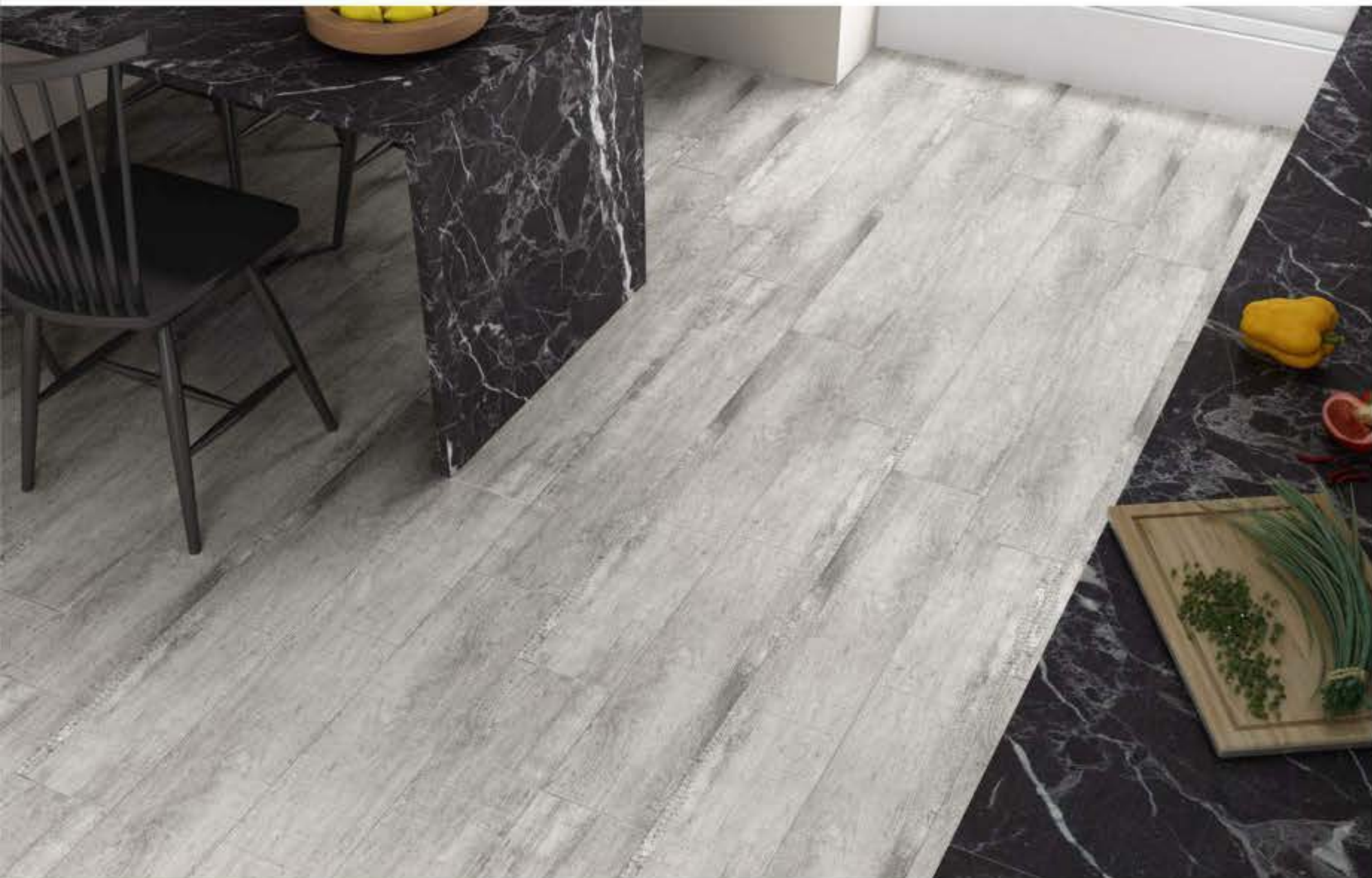
tiles shown: 5007