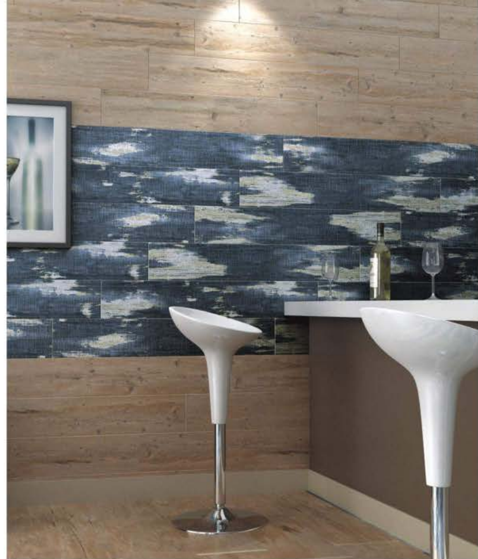
tiles shown: H - 653033