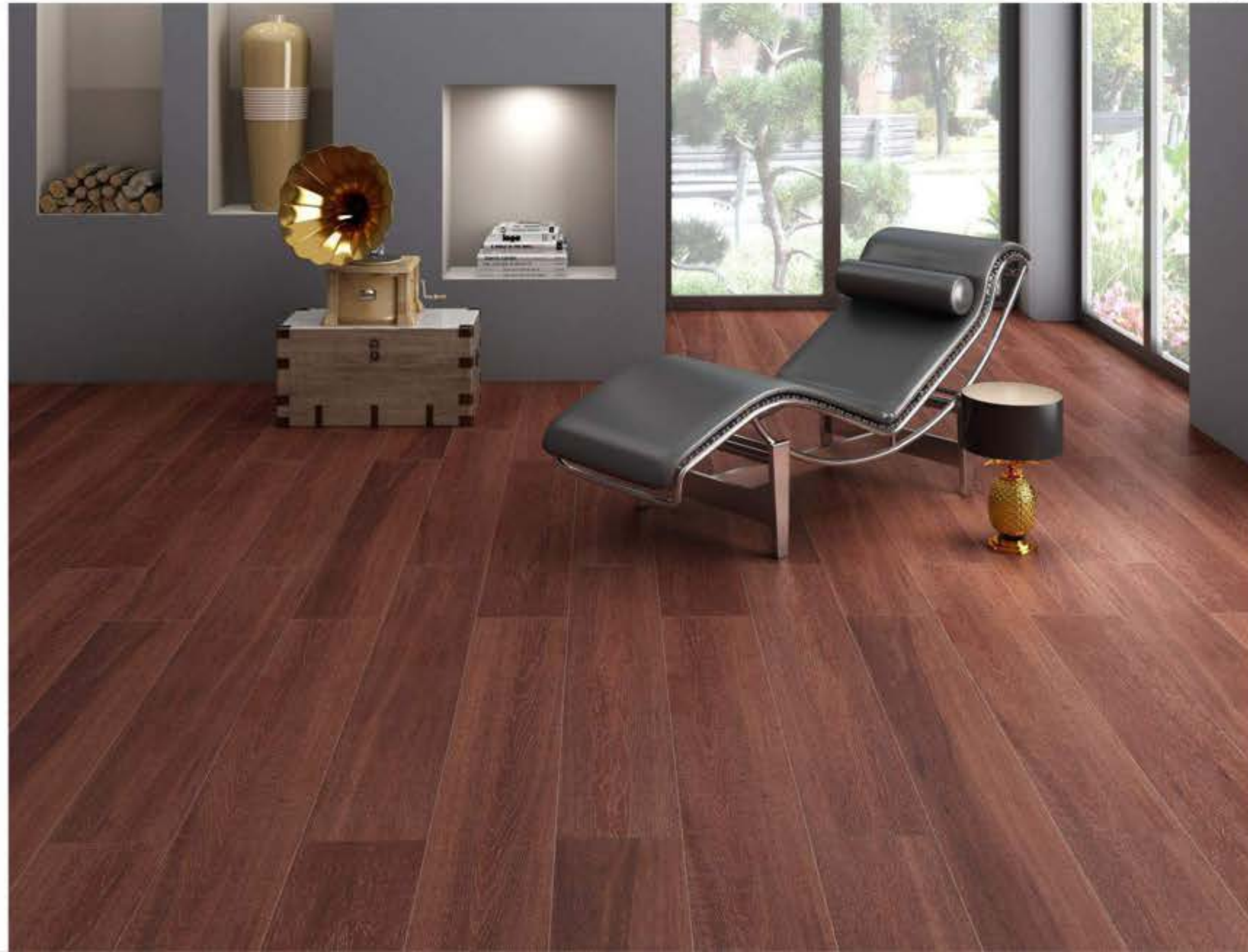
tiles shown: D6 - 15234