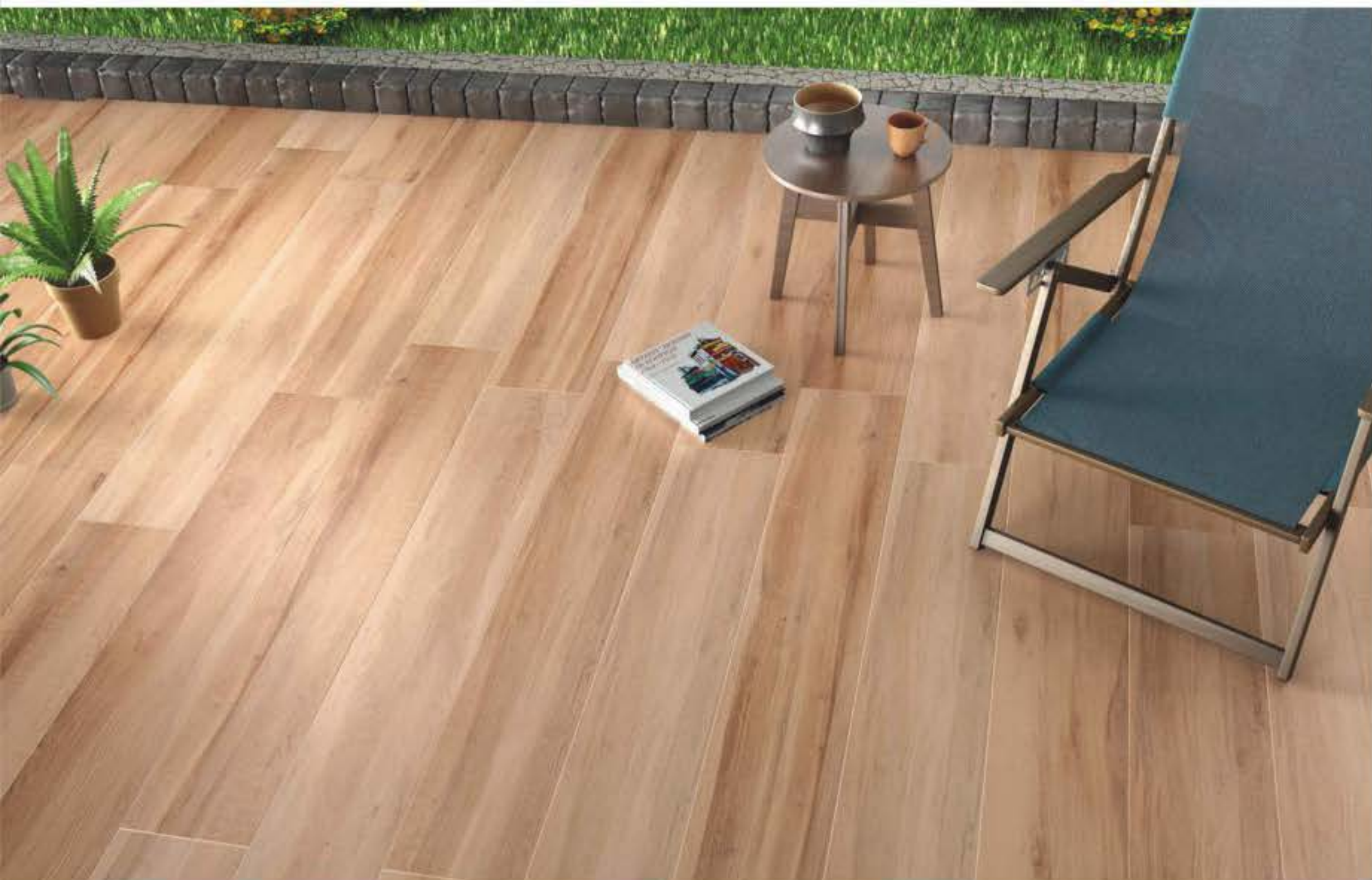
tiles shown: D6 - 15240