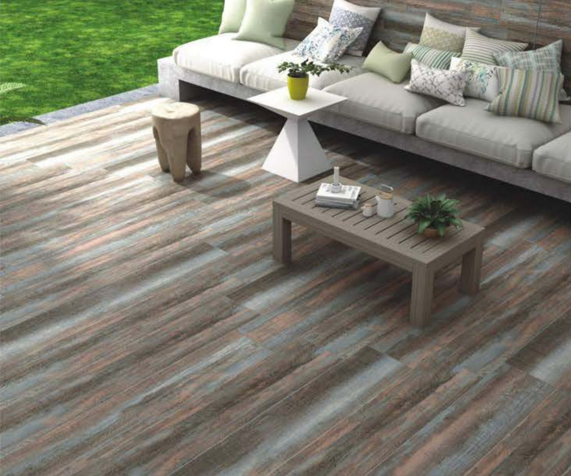
tiles shown: P5 - 21084