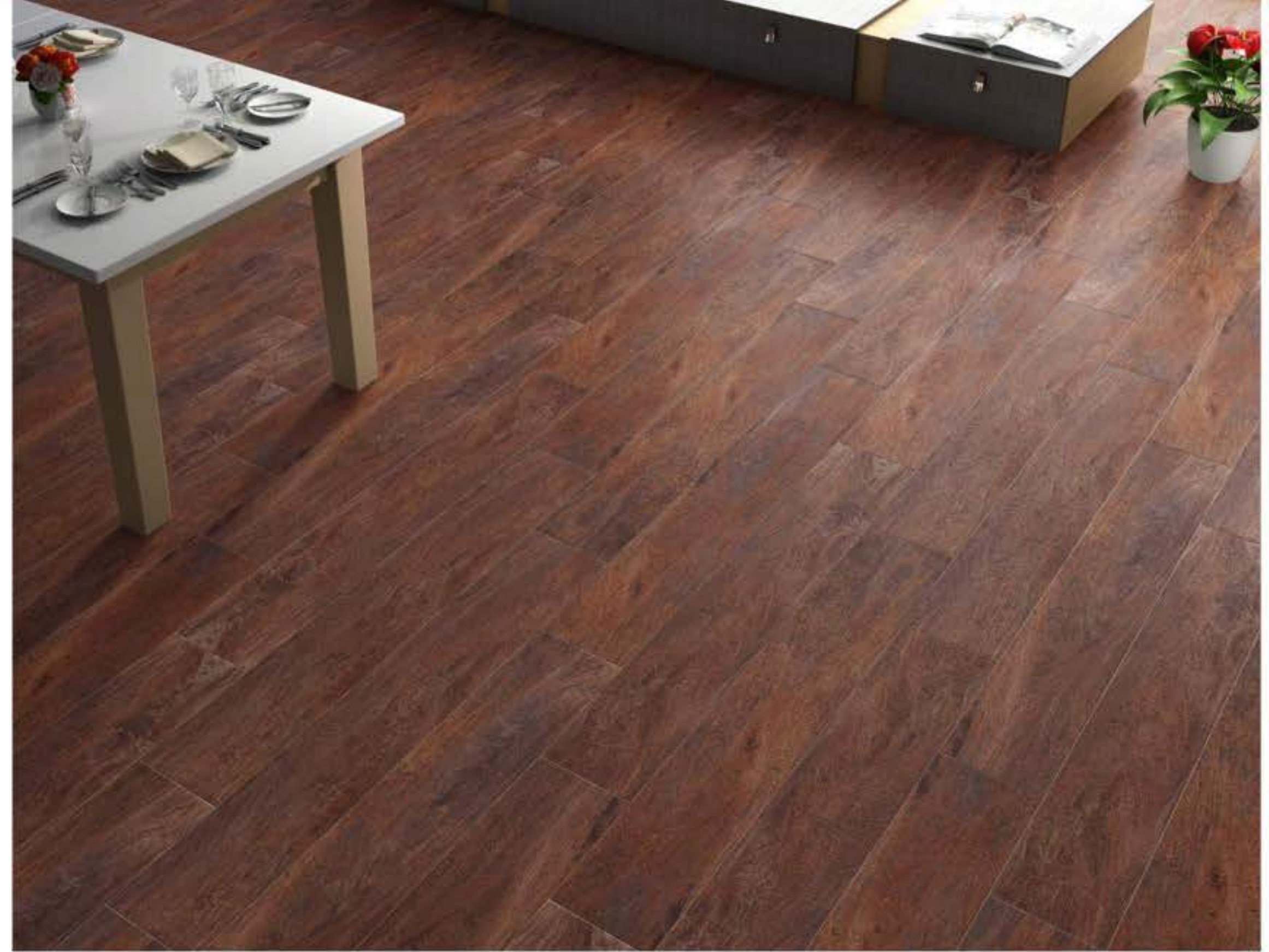
tiles shown: JK - 915446