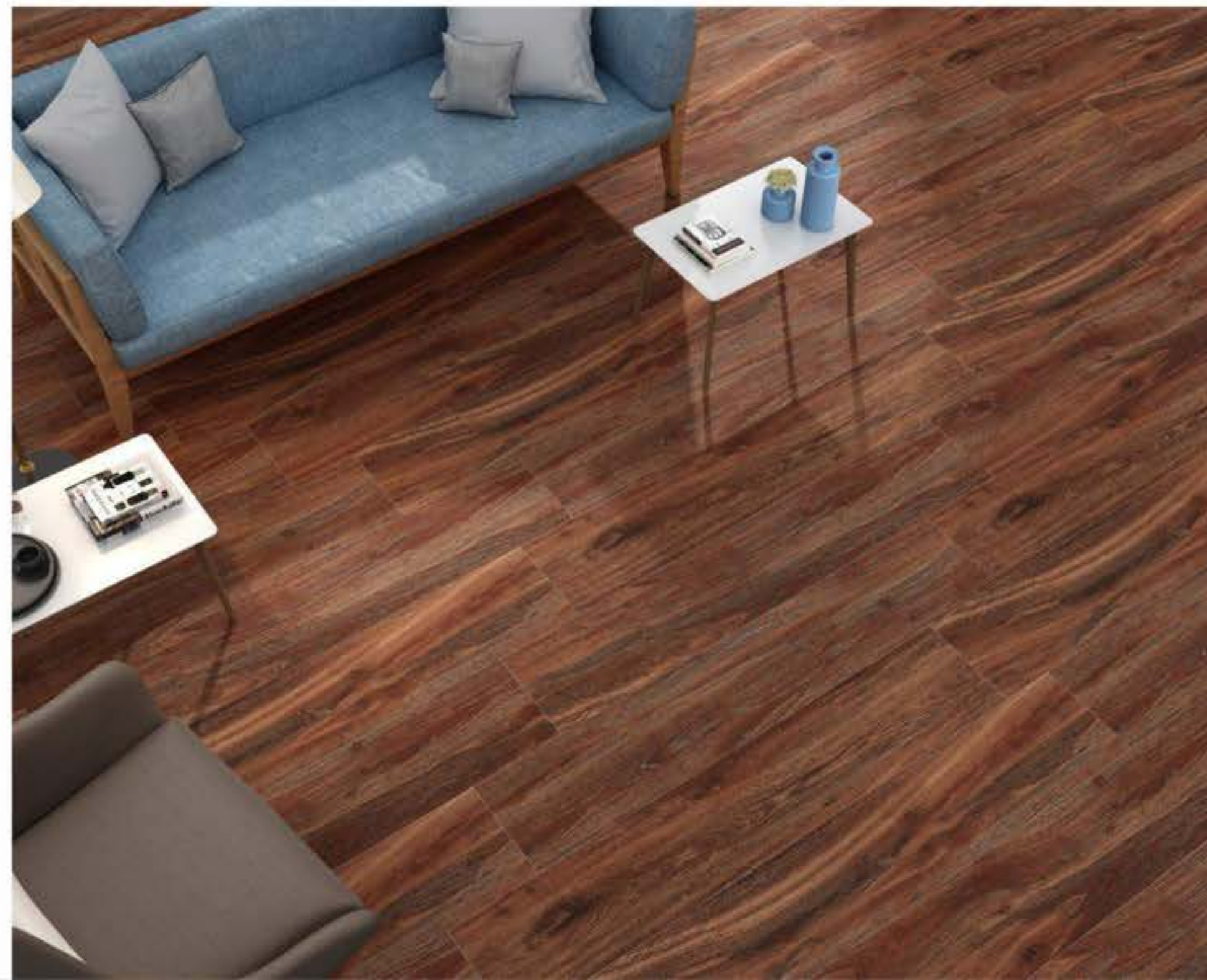
tiles shown: D6 - 15233