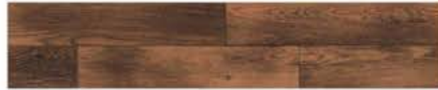
JK - 915444