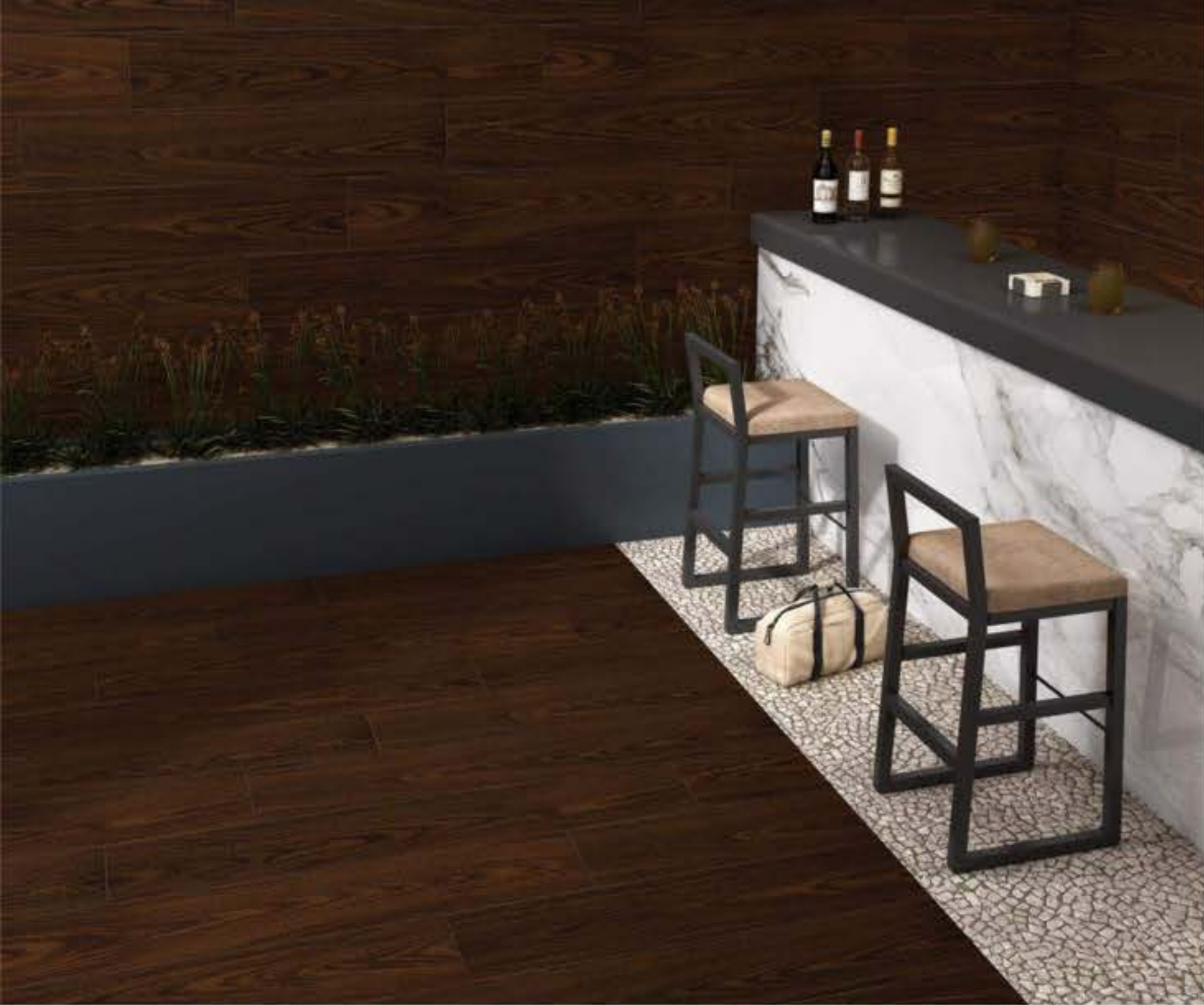
tiles shown: M5 - 60245