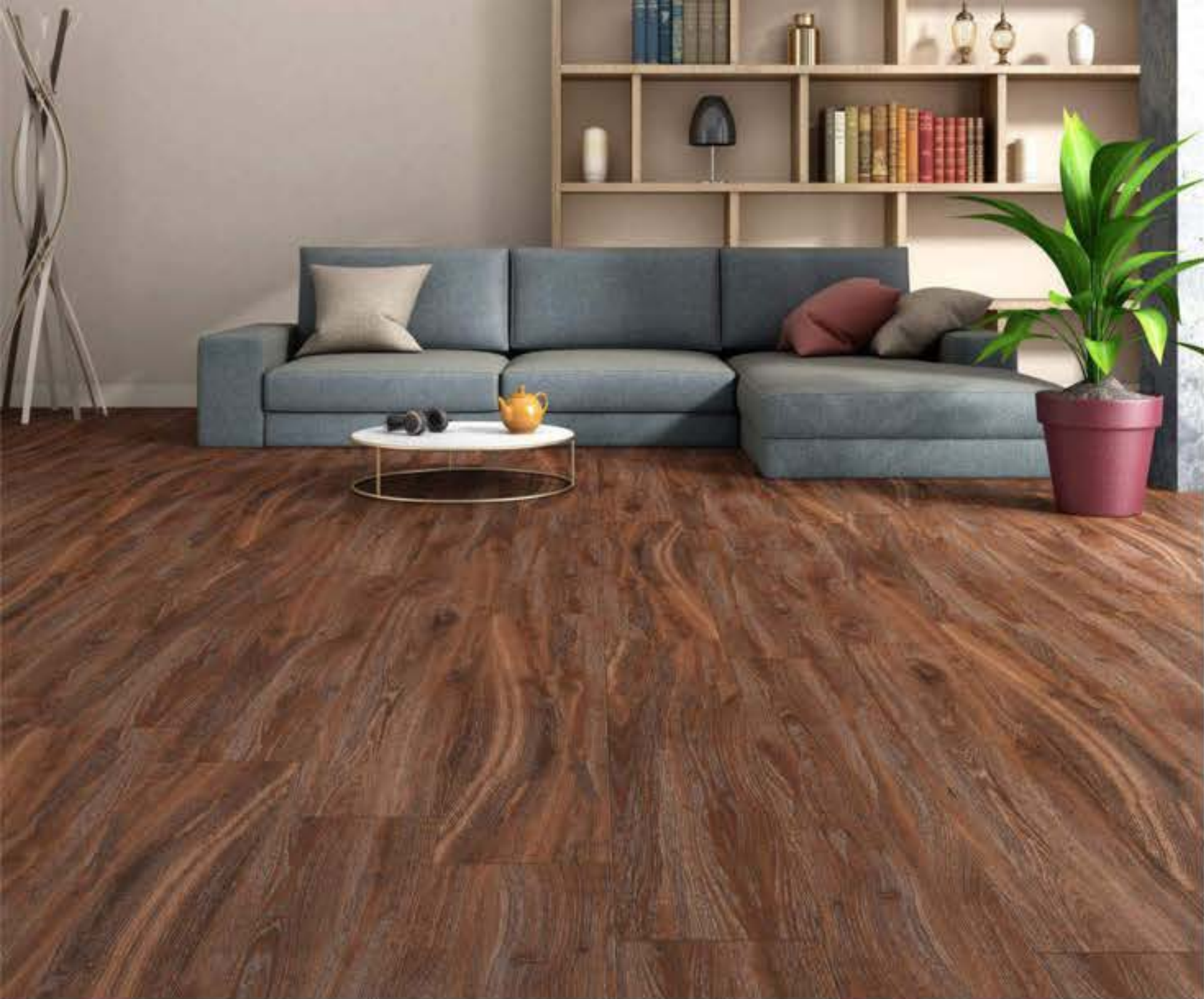
tiles shown: D6 - 15232