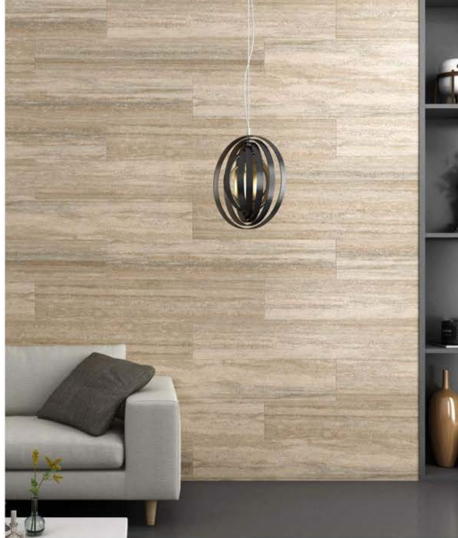
tiles shown: T8 - 8002