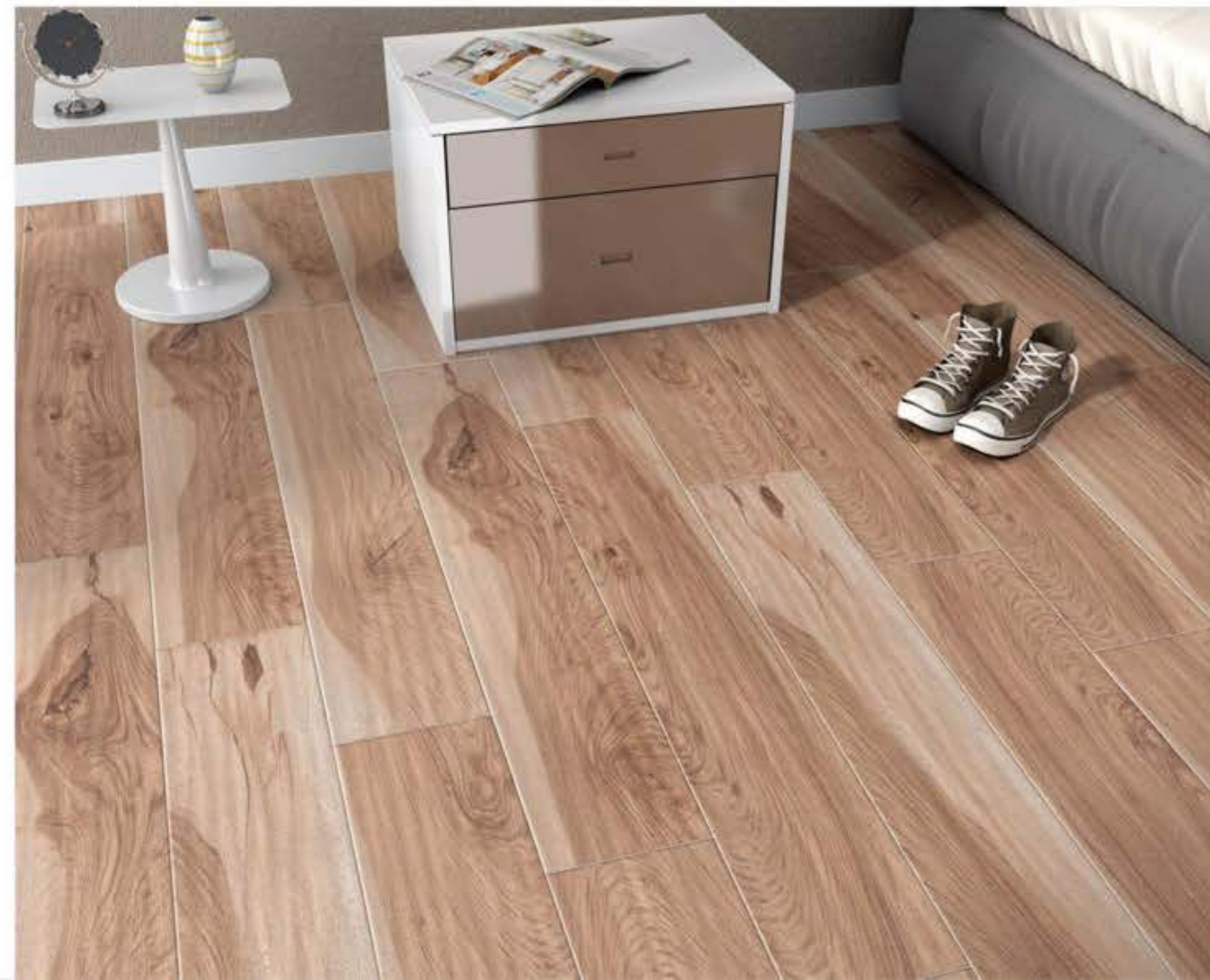
tiles shown: QL - 1224952