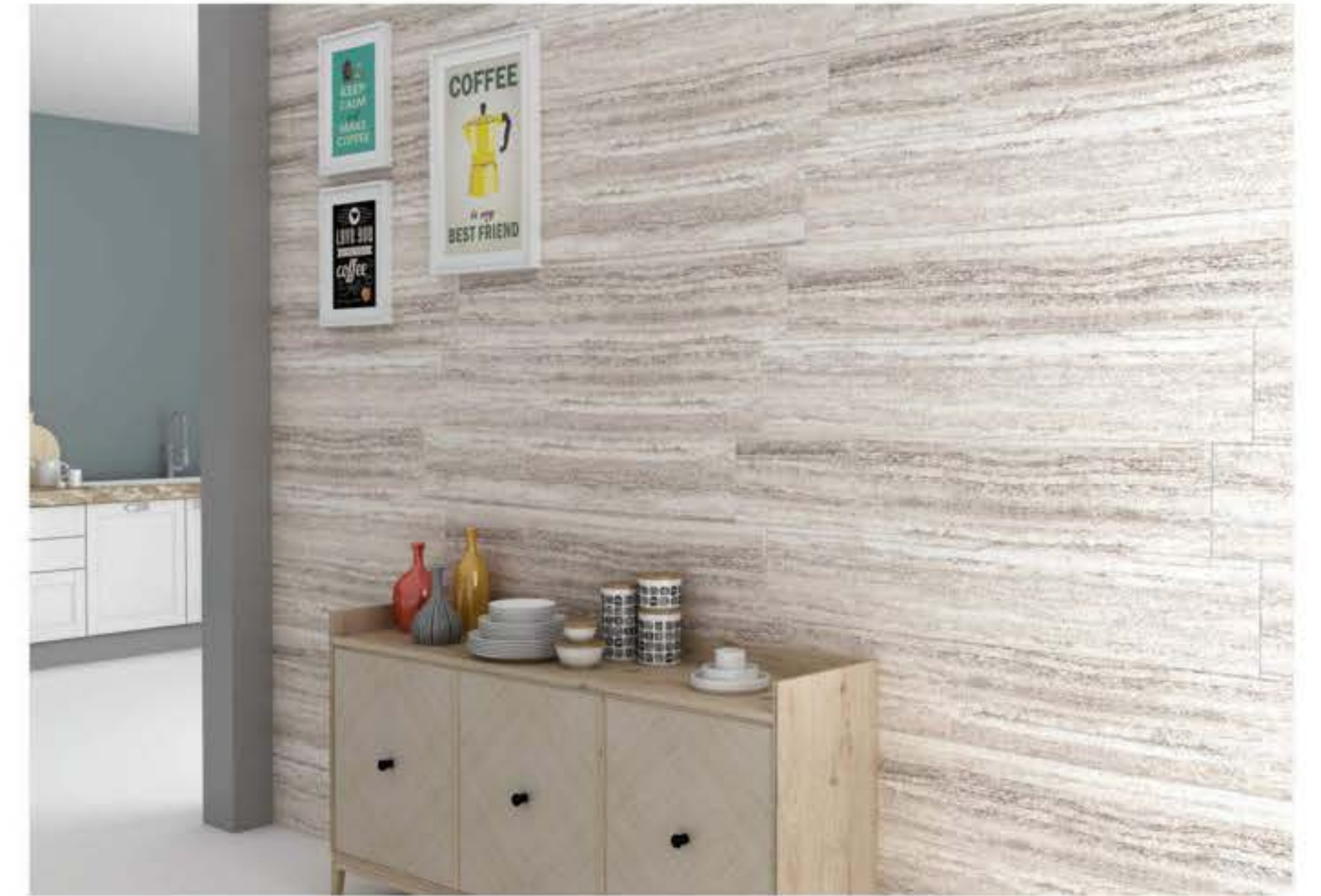
tiles shown: T4 - 465404