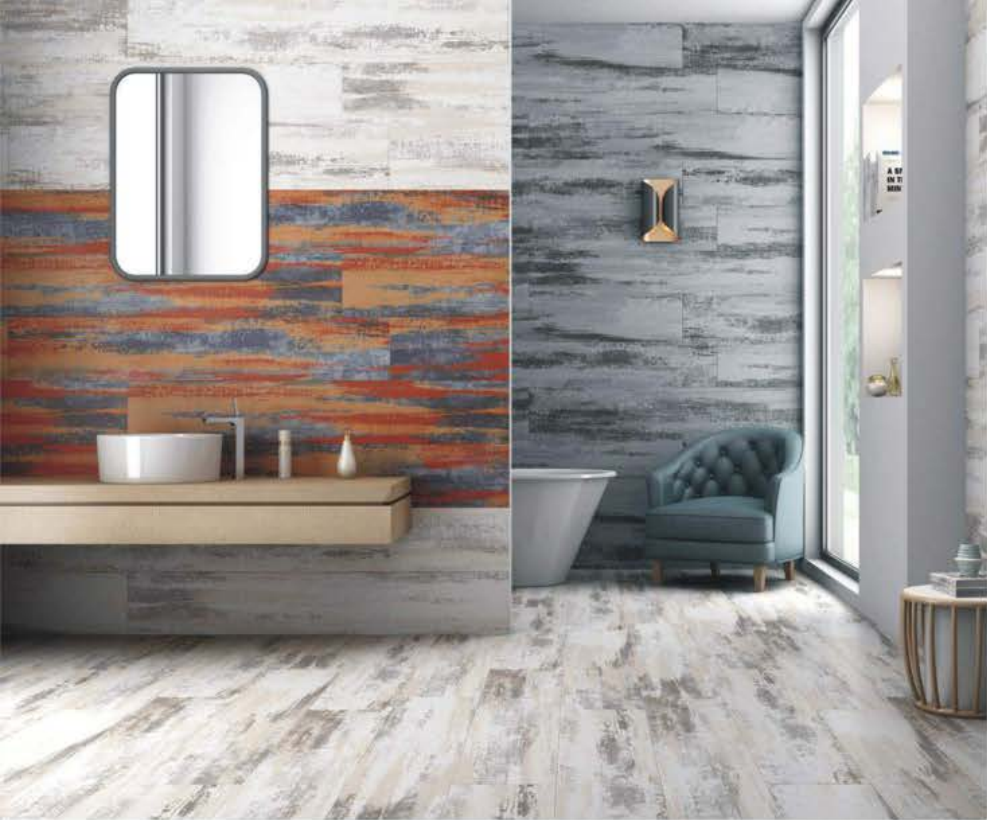
tiles shown: Margllos, Margllos White, Margllos Grey