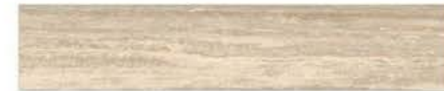
T8 - 8002