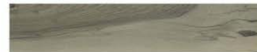
QL - 1224951