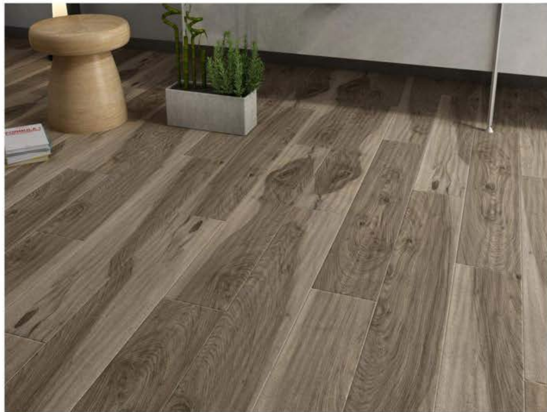
tiles shown: QL - 1224953