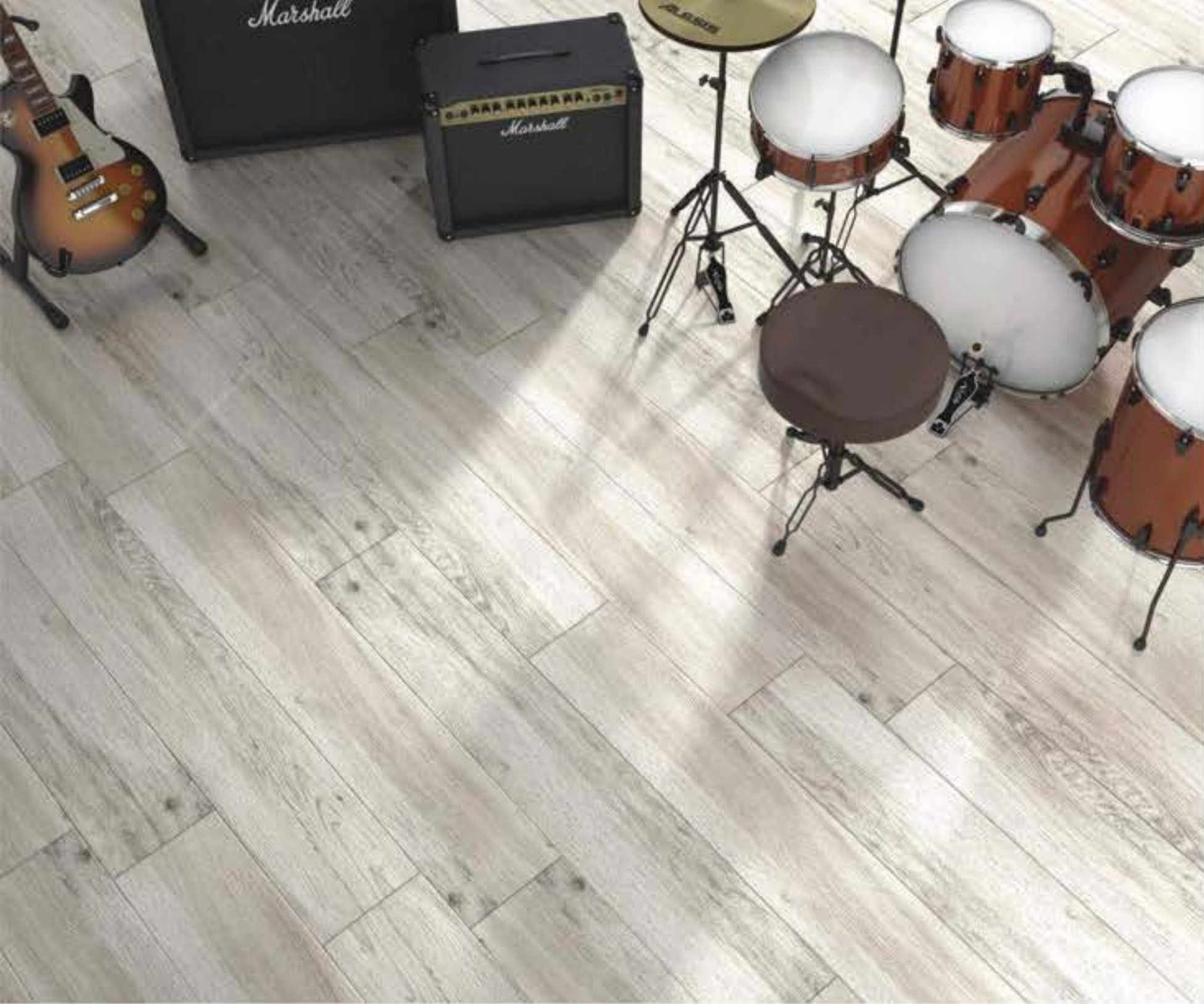
tiles shown: 5001