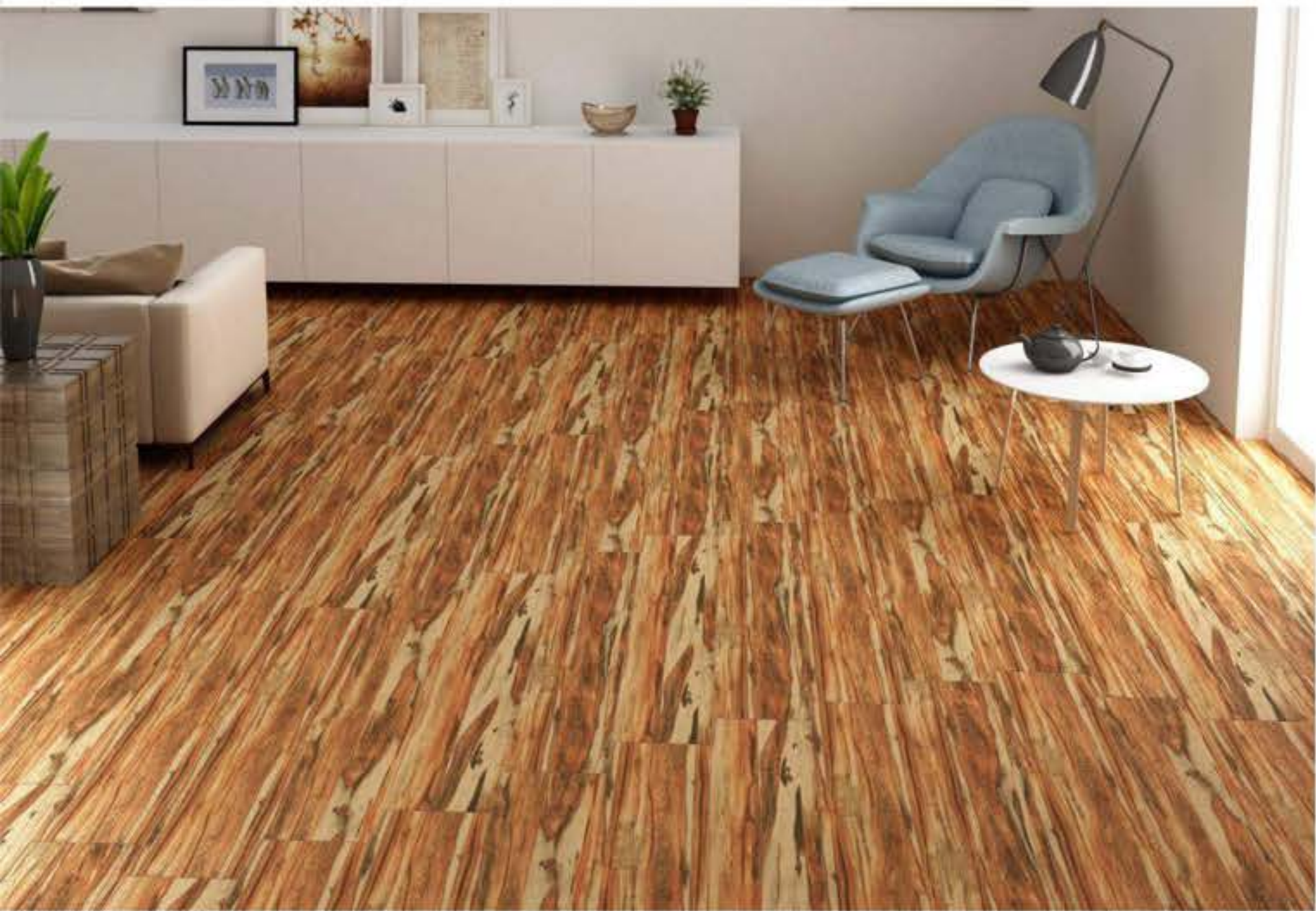
tiles shown: 21083