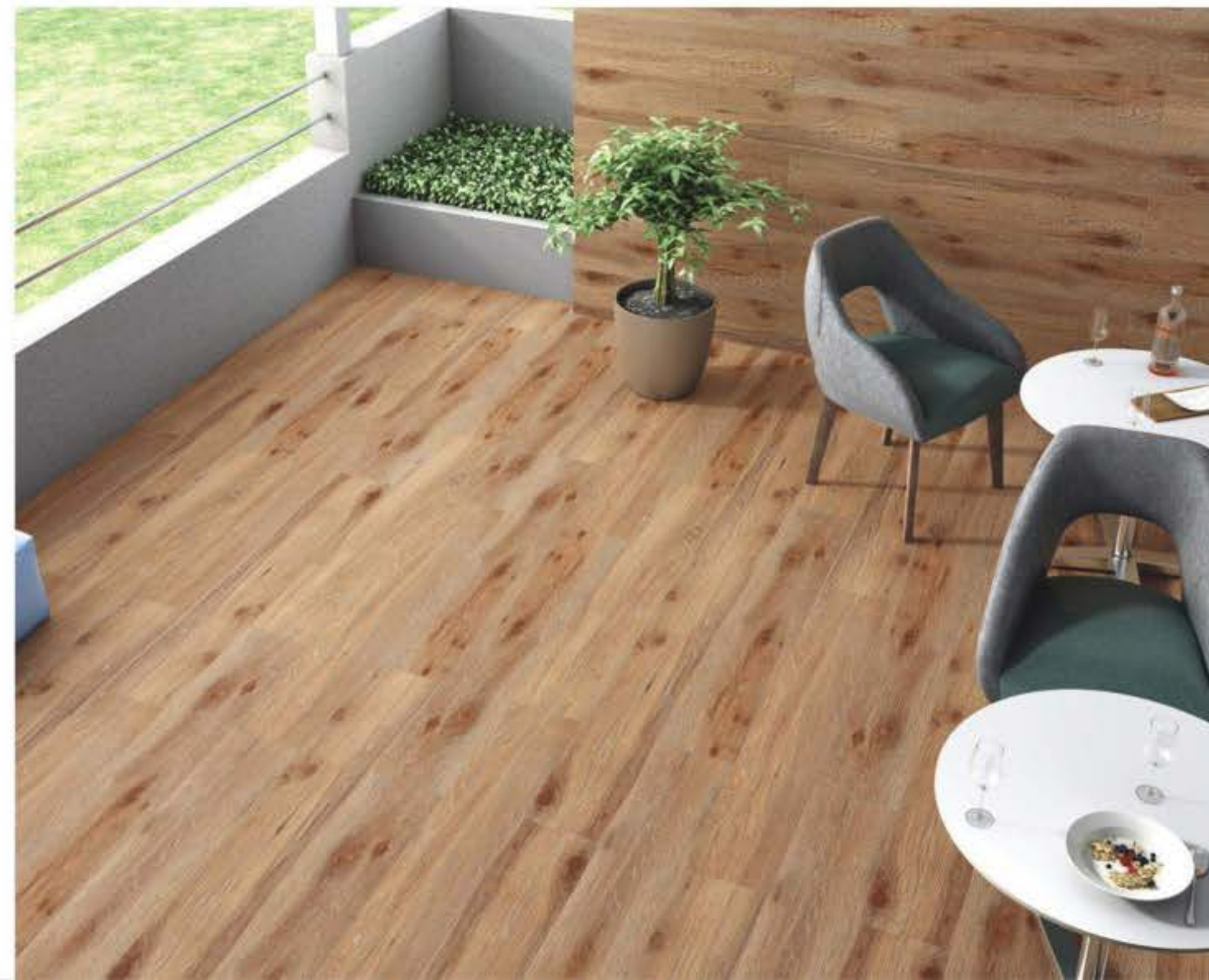
tiles shown: M5 - 60246