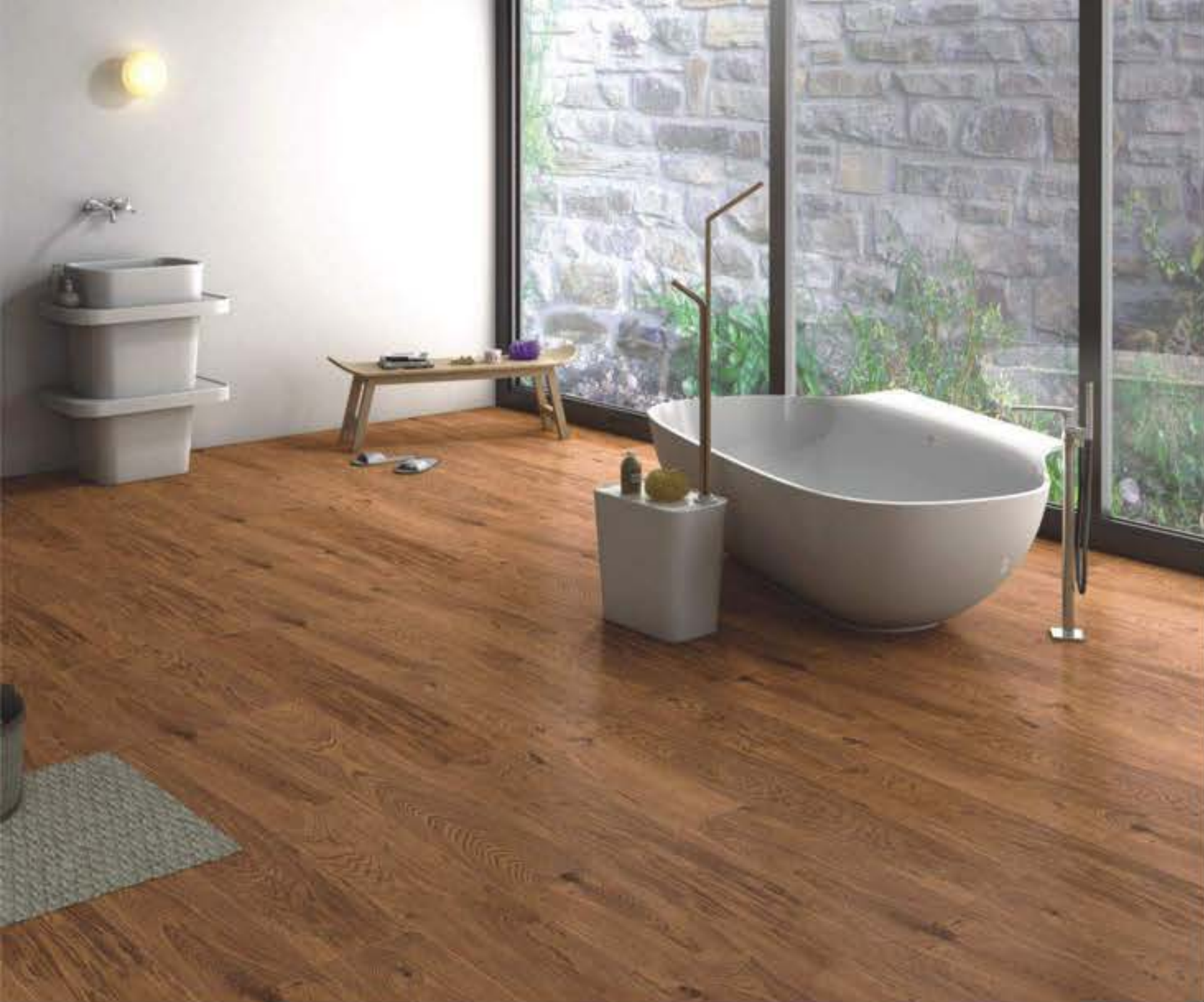
tiles shown: D6 - 15246