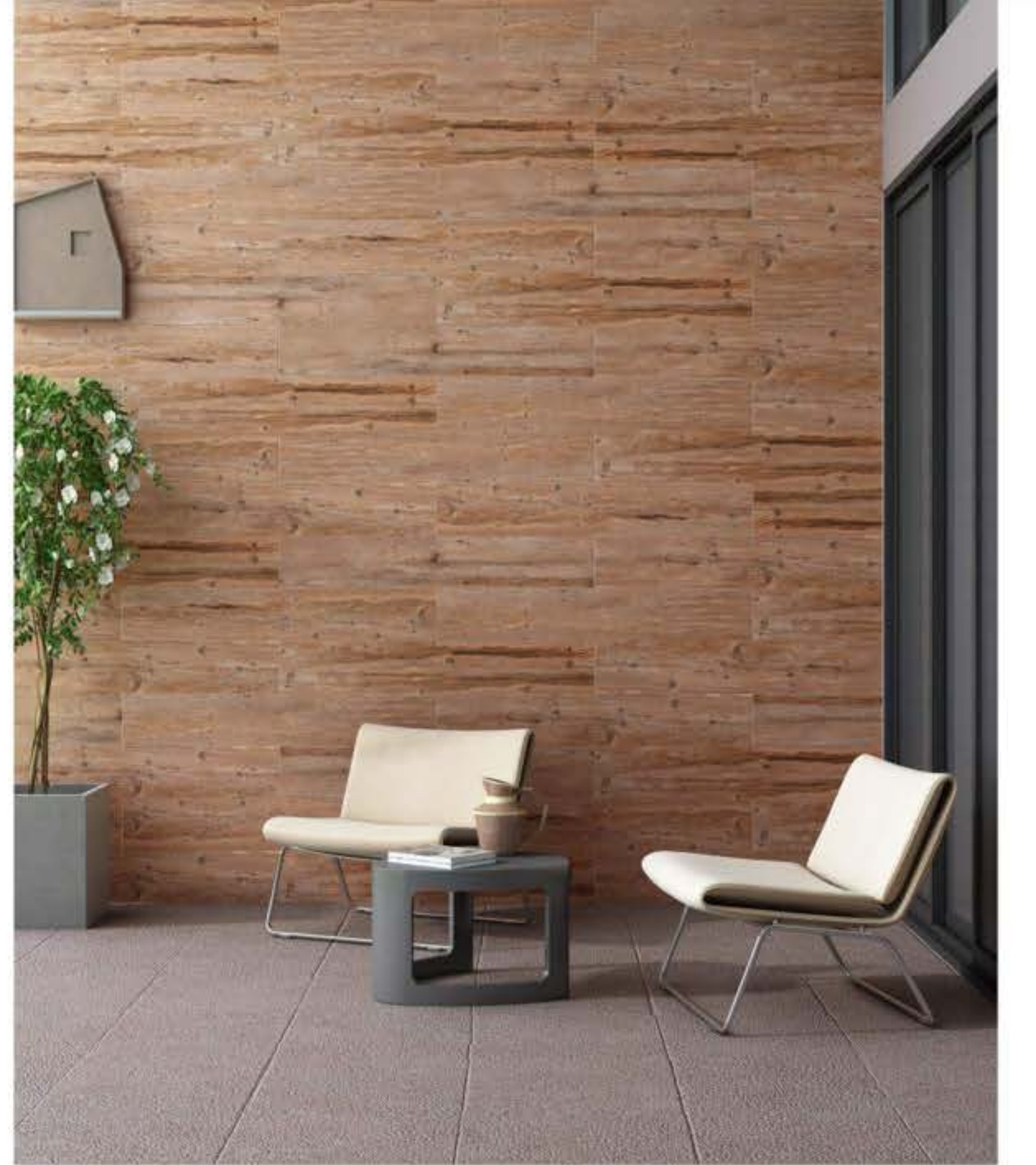
tiles shown: JK - 915448