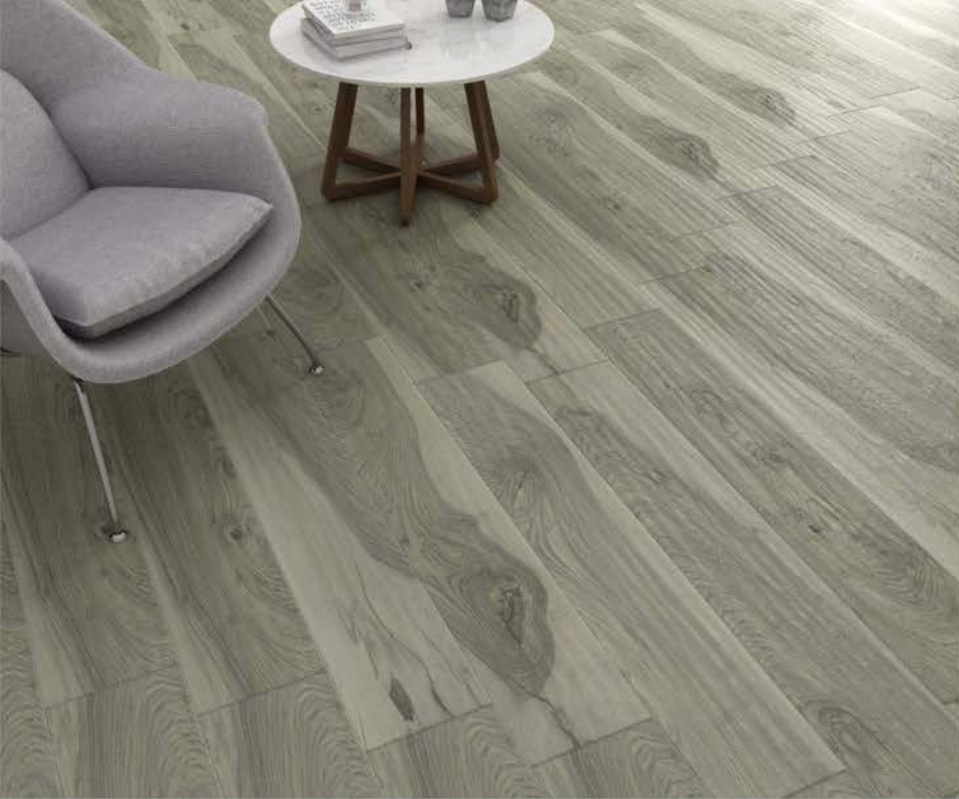
tiles shown: QL - 1224951