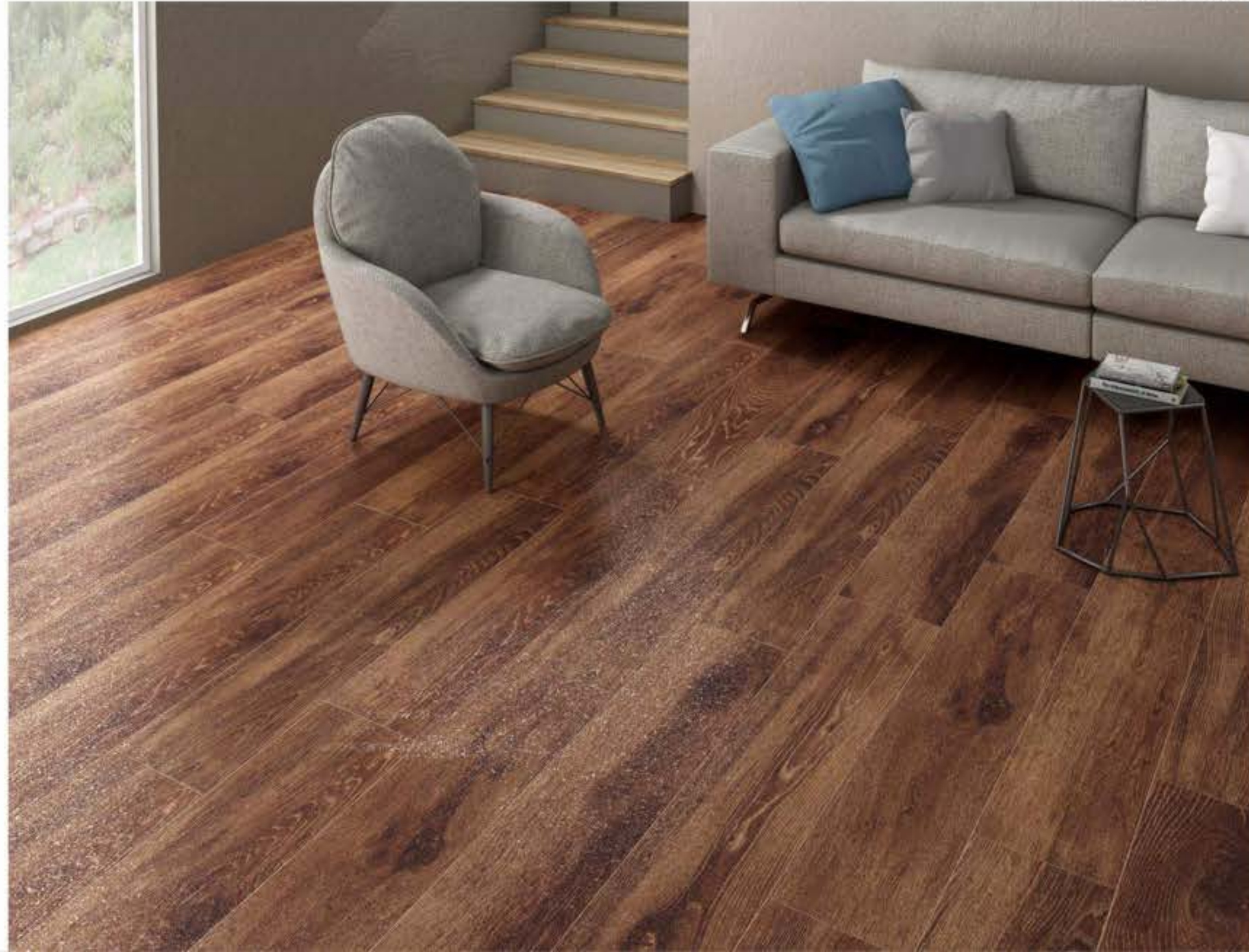
tiles shown: S7 - 20156