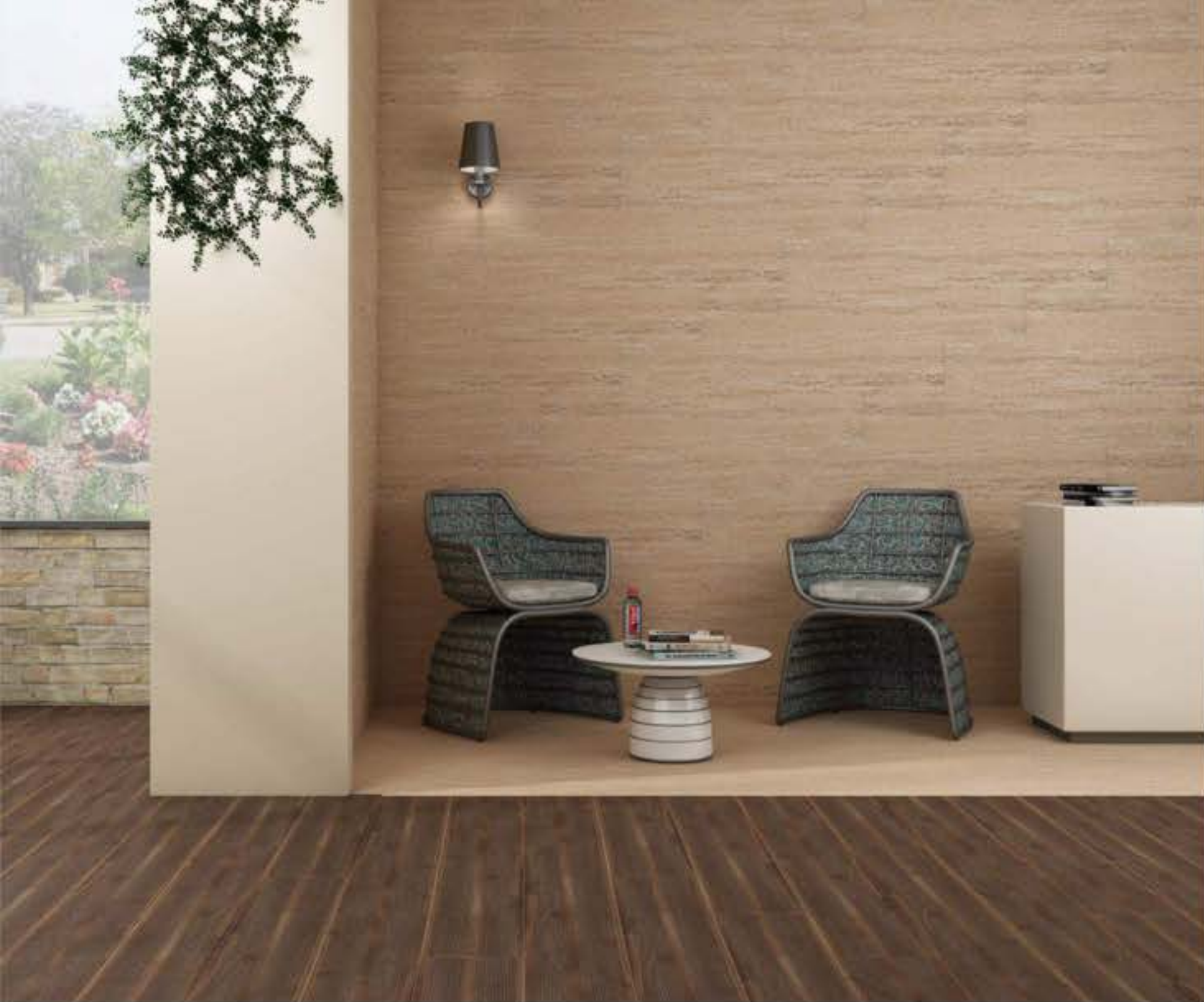
tiles shown: T1 - 465401