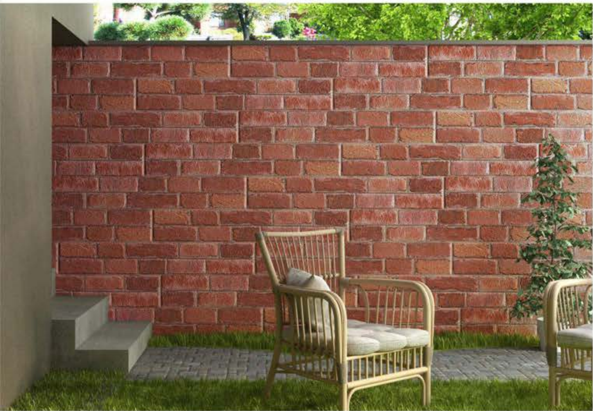
tiles shown: haggerty bricks