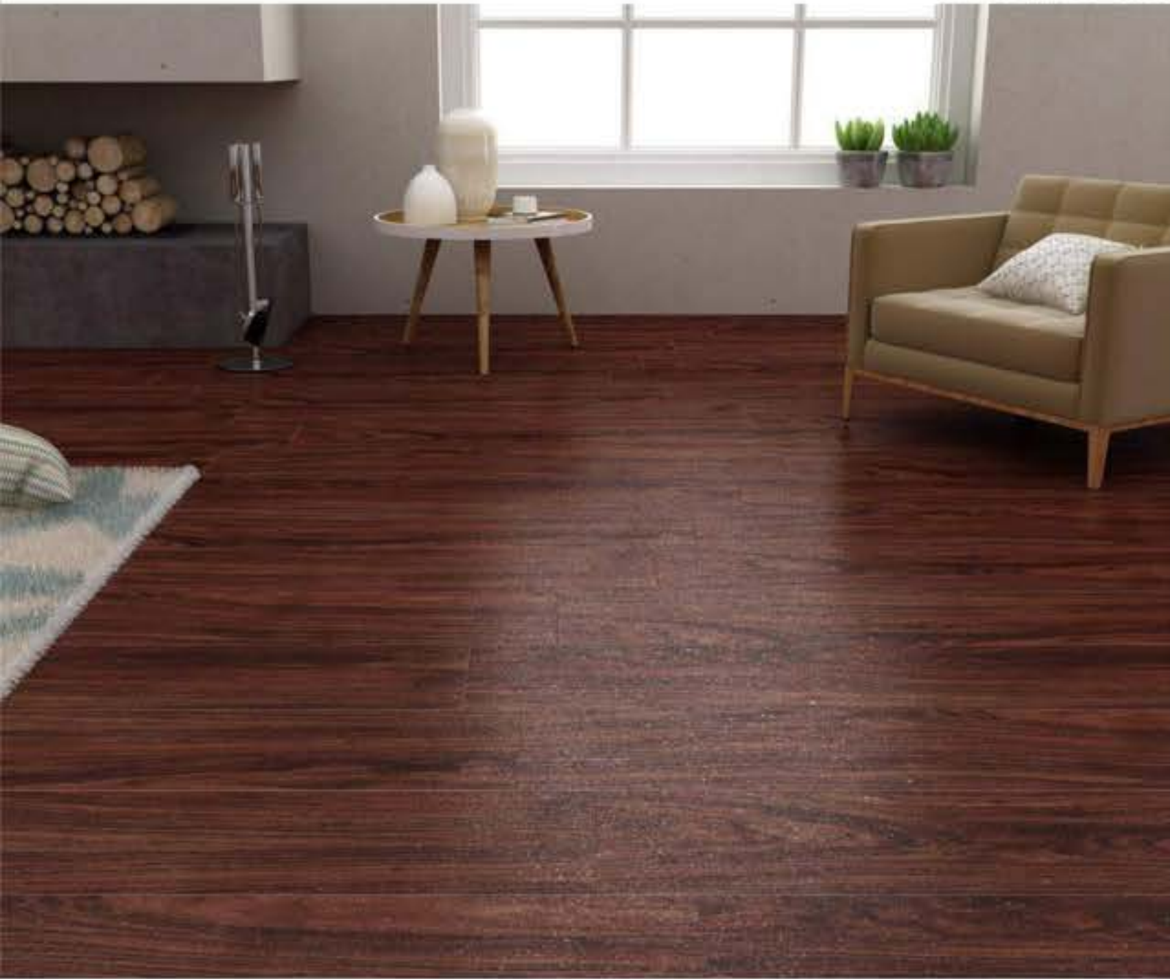
tiles shown: S7 - 20158