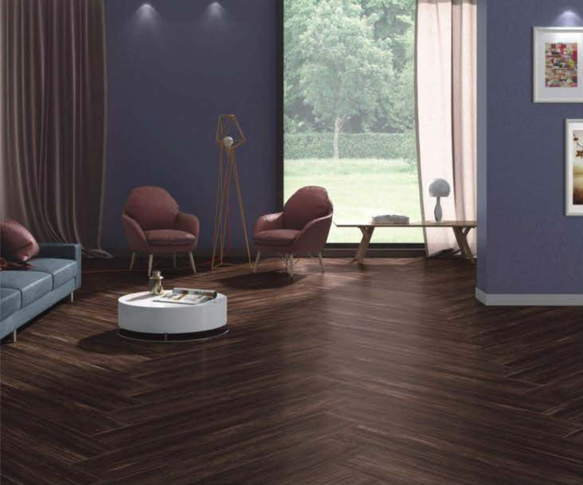
tiles shown: R1 - 42301