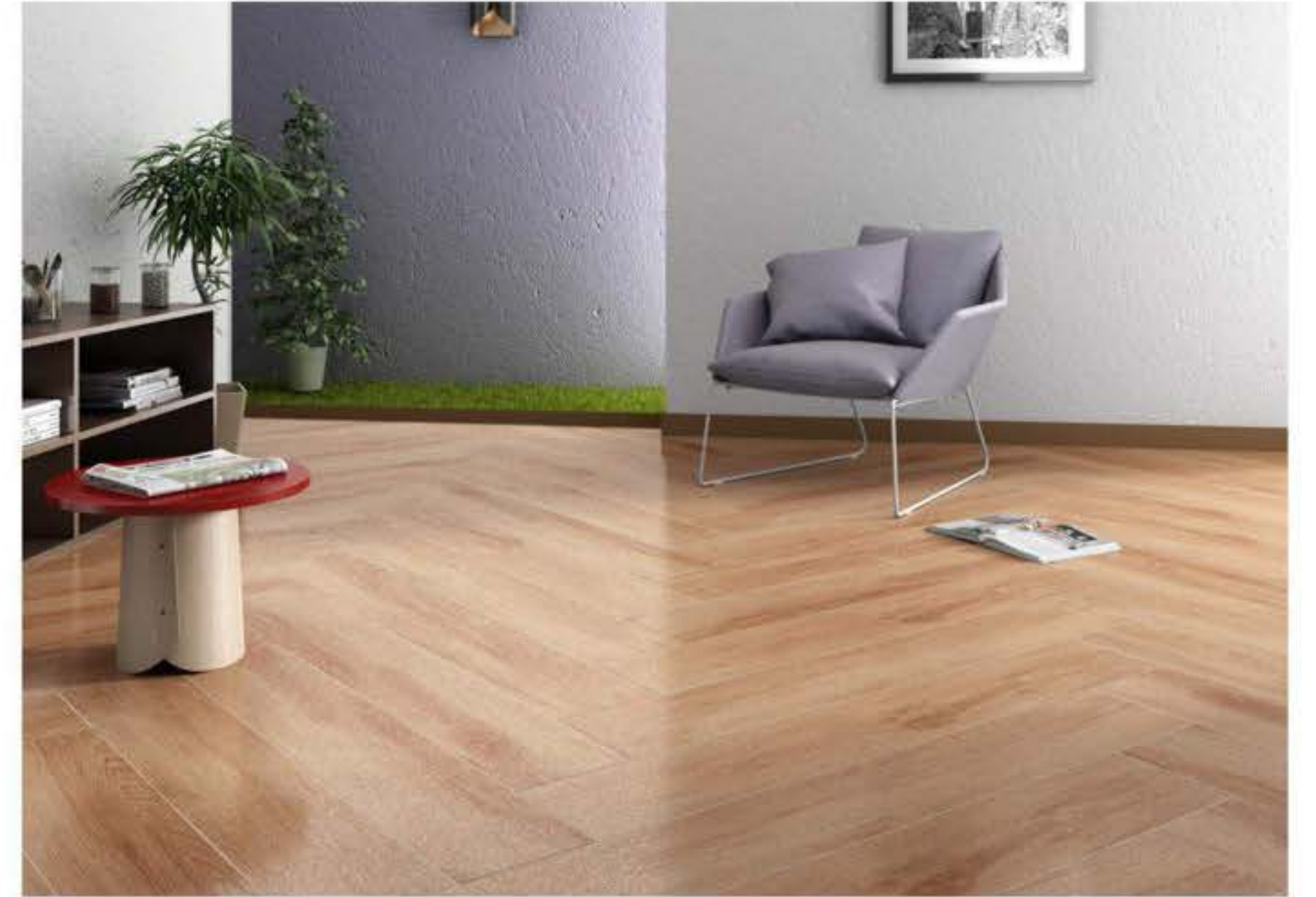
tiles shown: S7 - 20157