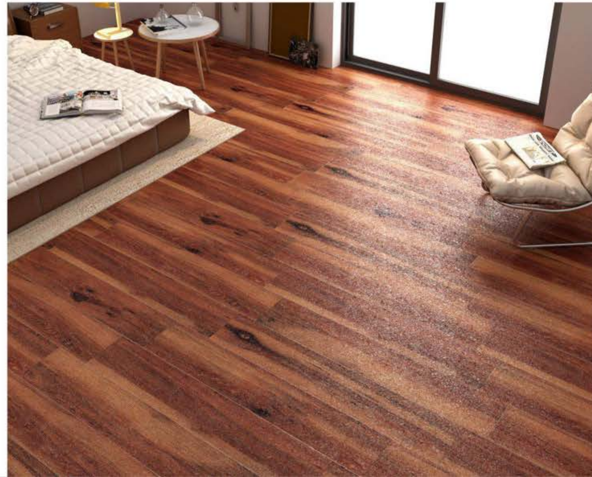
tiles shown: S7 - 20155