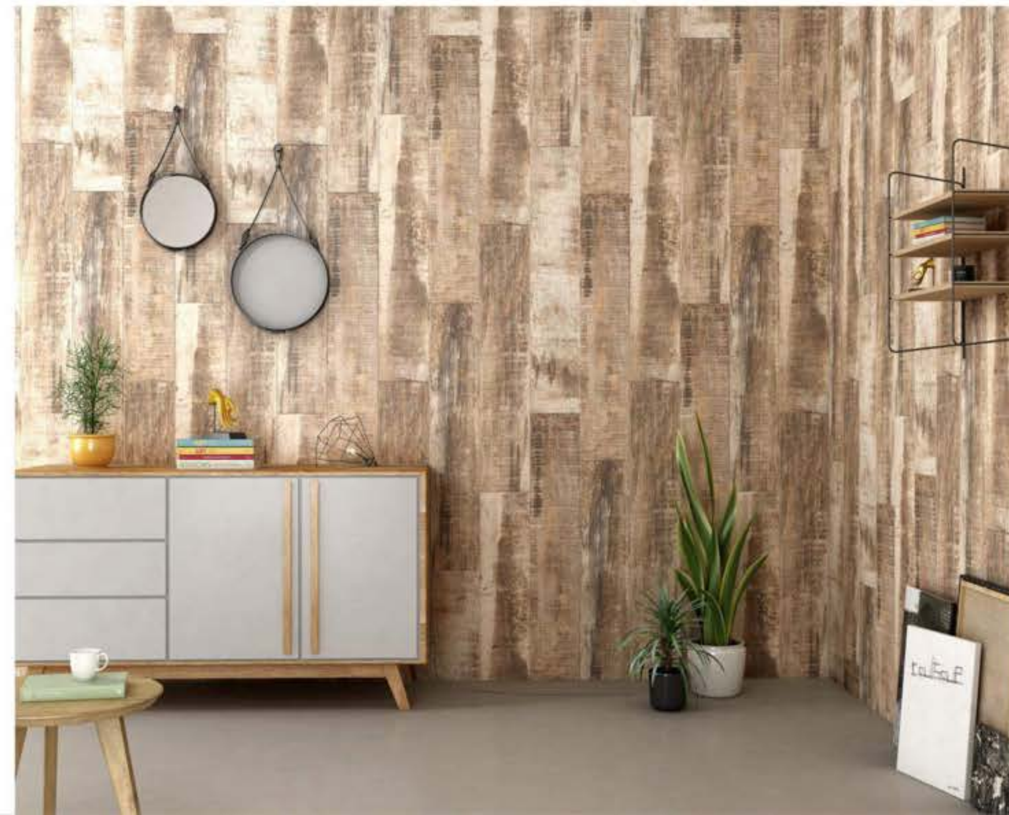
tiles shown: R1 - 42302